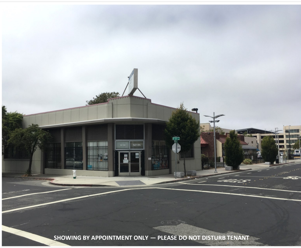
SHOWING BY APPOINTMENT ONLY — PLEASE DO NOT DISTURB TENANT