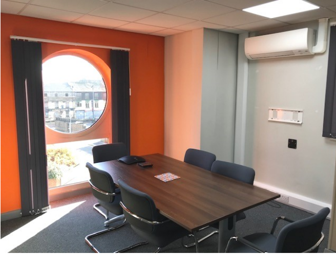
Atlas 1, 2nd Floor