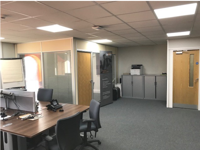
Atlas 1, 2nd Floor