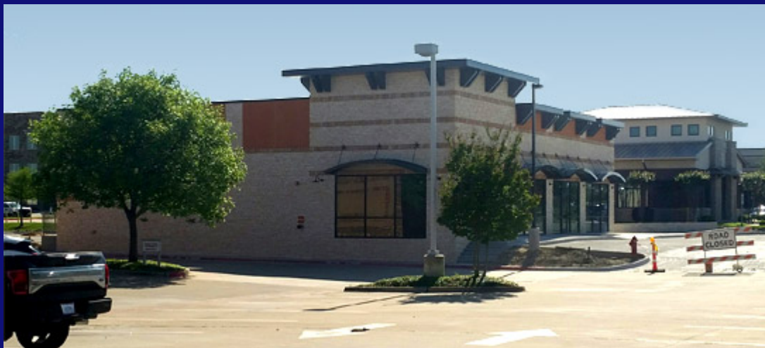
Eldorado Parkway and Ridge Road in McKinney, Texas

Click here for additional photos and aerials of Stonebridge Commons