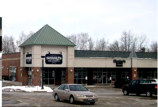
Twinsburg Plaza • 10735 Ravenna Rd.