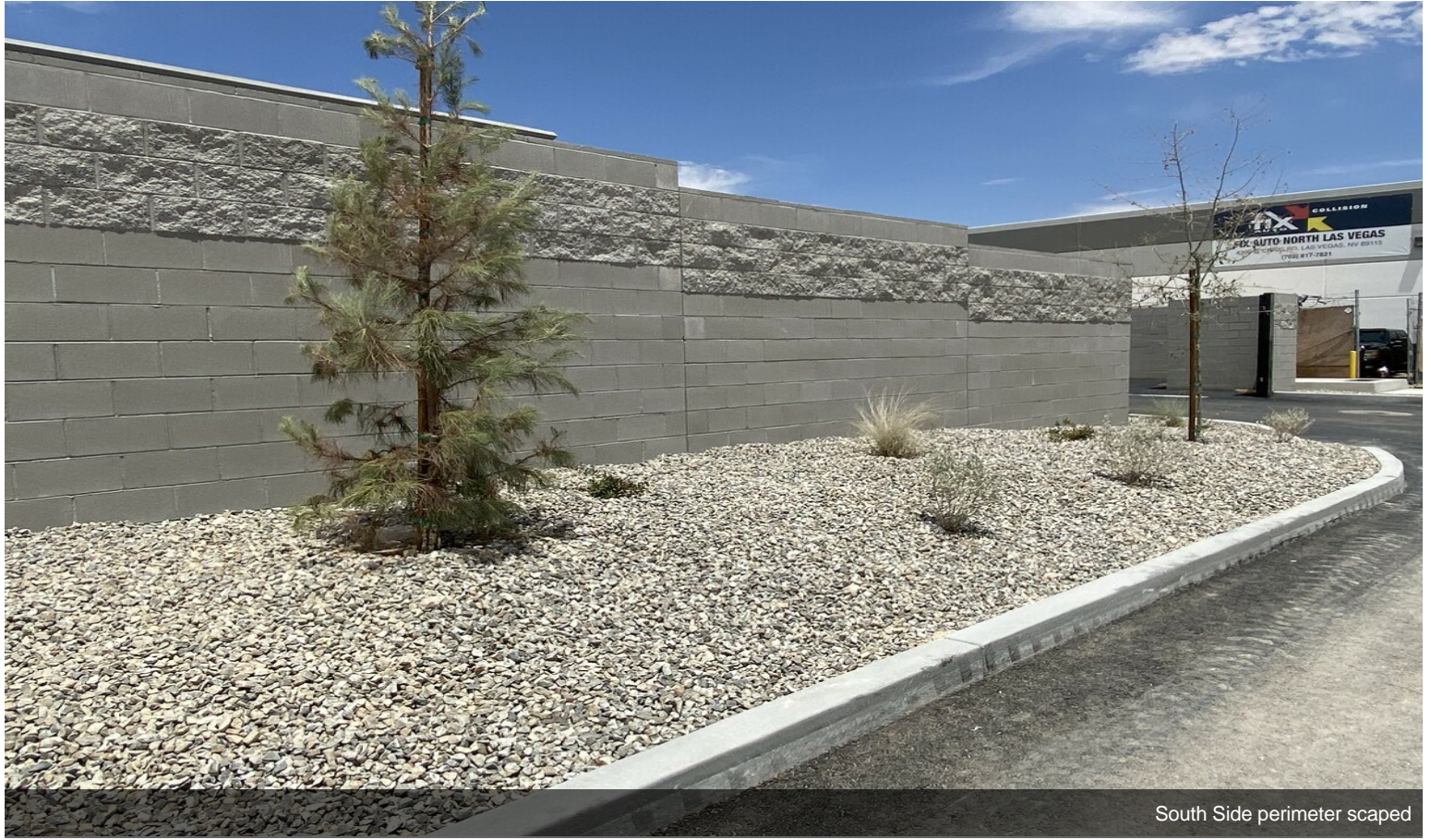
South Side perimeter scape