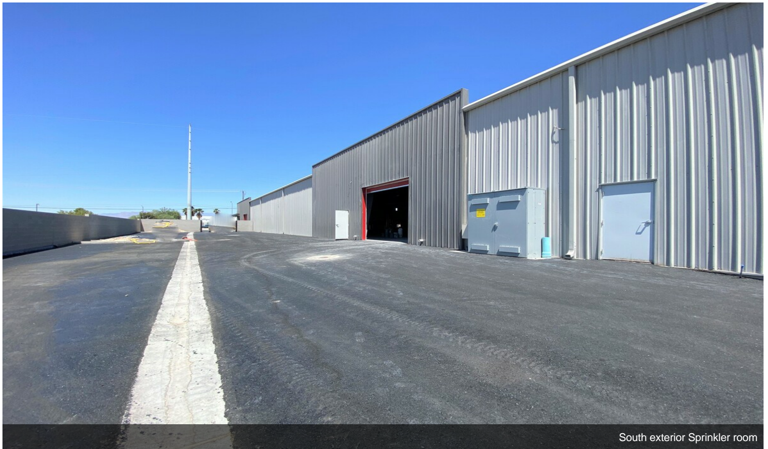
South exterior Sprinkler room