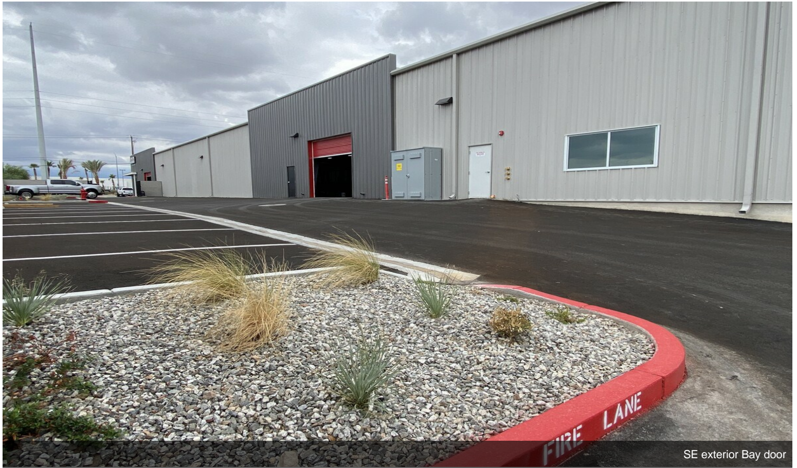
SE exterior Bay door