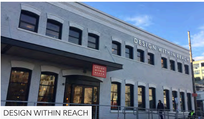
DESIGN WITHIN REACH