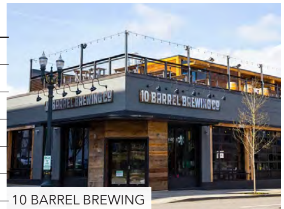
10 BARREL BREWING