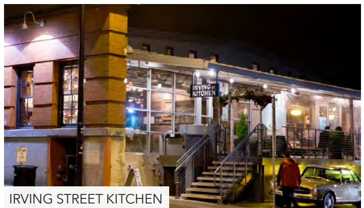
IRVING STREET KITCHEN