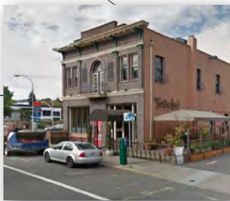
HISTORIC FORMER FIRESTATION BUILDING