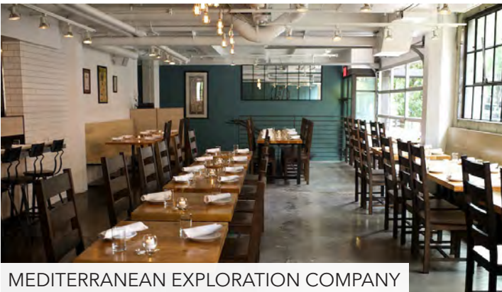
MEDITERRANEAN EXPLORATION COMPANY