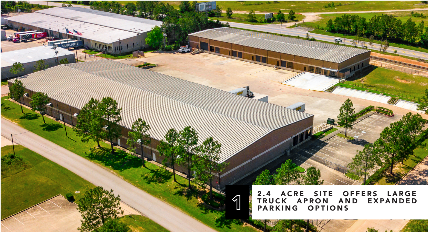
2.4 ACRE SITE OFFERS LARGE TRUCK APRON AND EXPANDED PARKING OPTIONS