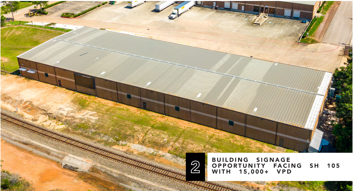
BUILDING SIGNAGE OPPORTUNITY FACING SH 105 WITH 15,000+ VPD