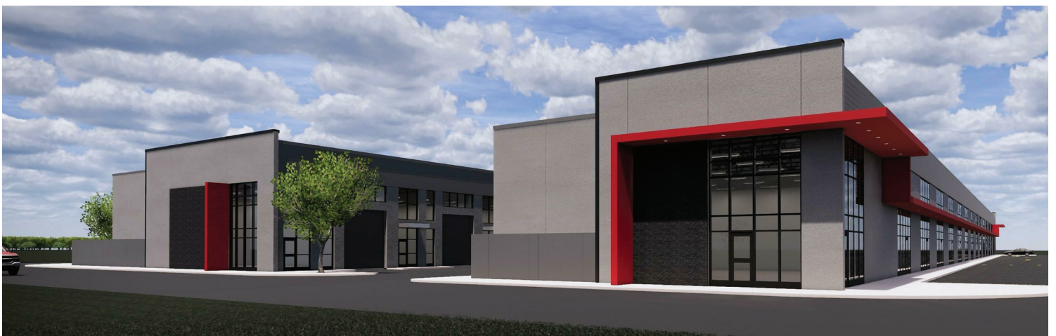
SOUTH FACADE VIEW FROM SOUTHEAST CORNER