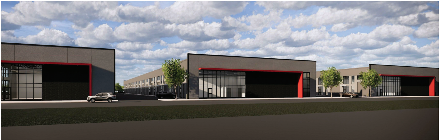
NORTH FACADE ALONG HASSERT