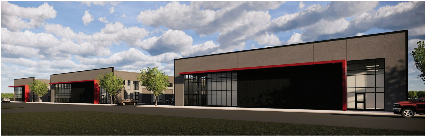
NORTH FACADE ALONG HASSERT