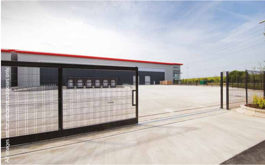
All images are for indicative purposes only.