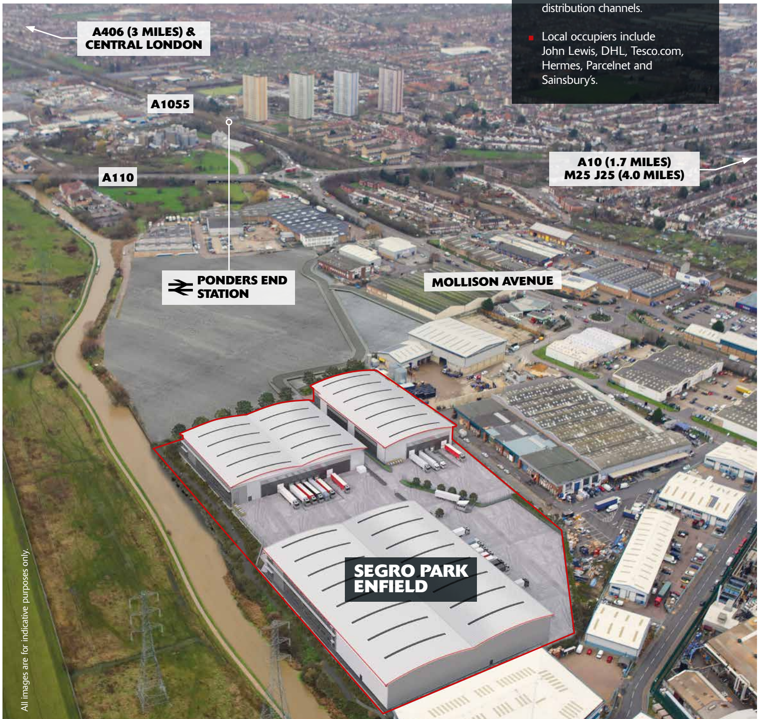
All images are for indicative purposes only.