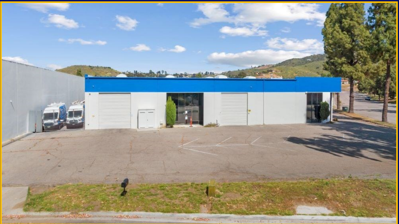
View from Stevens Road