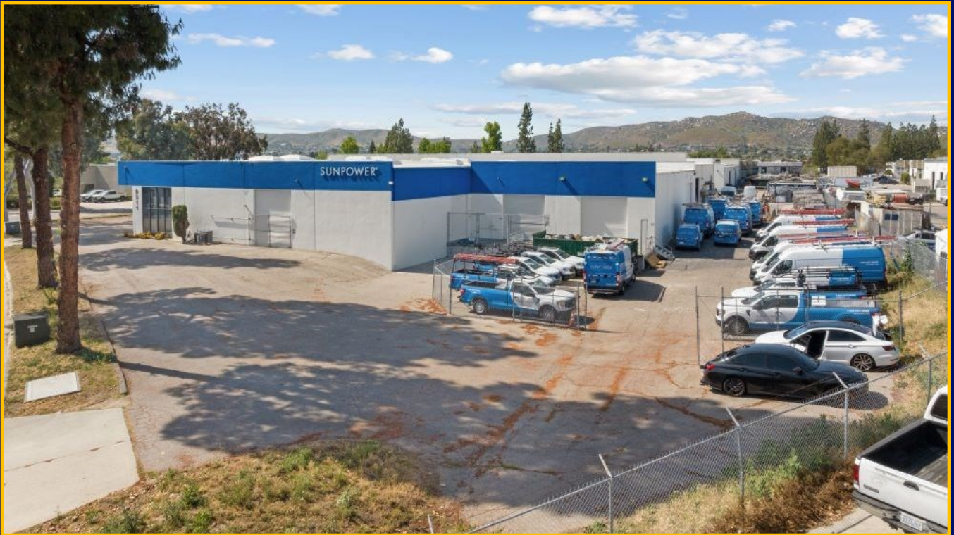
View from Hartley Road