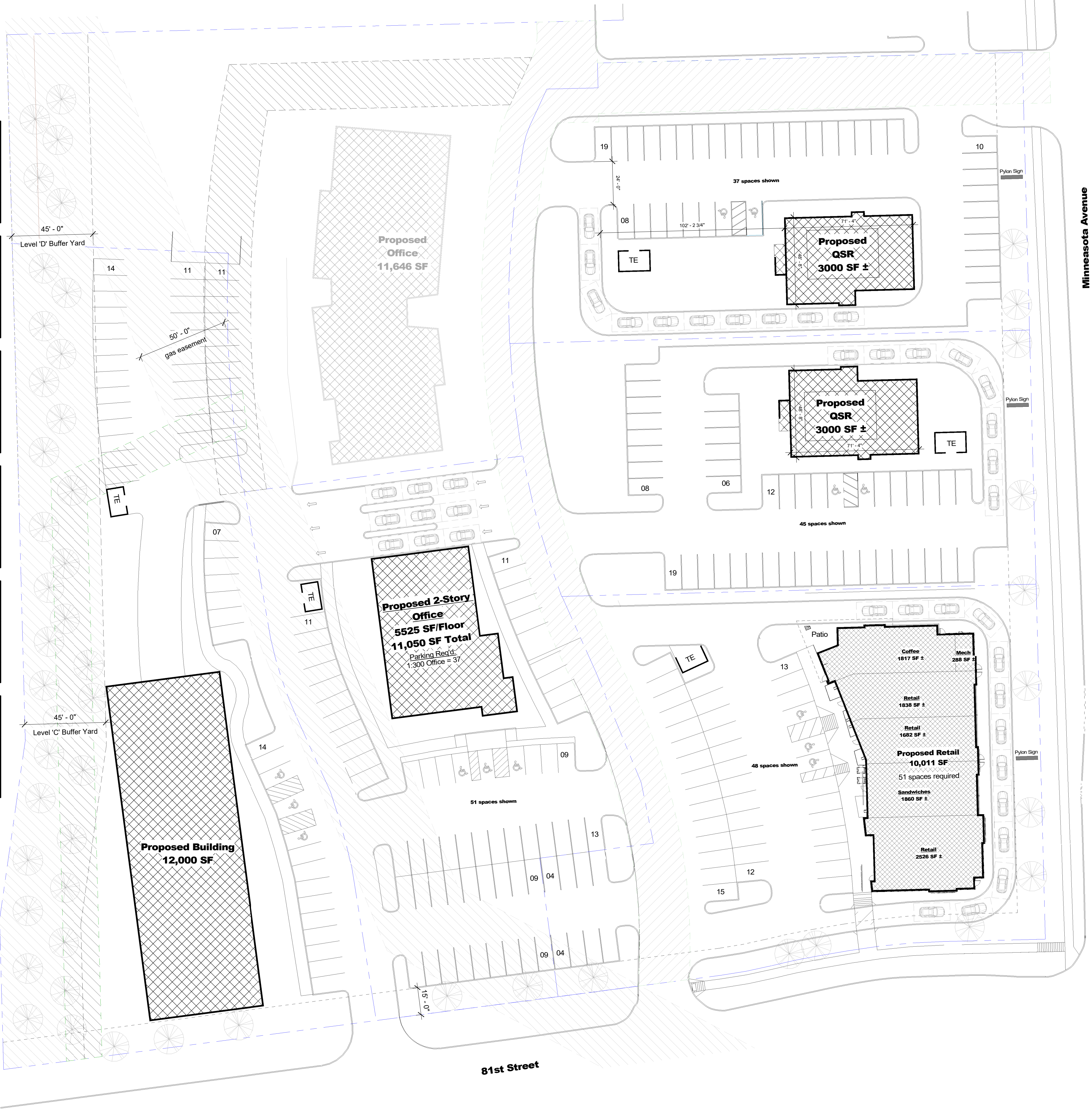
1 Overall Site Plan Scale: 1" = 30'-0"