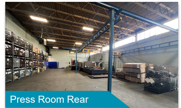
Press Room Rear