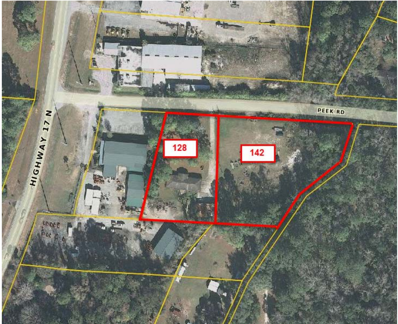
Parcel#: 03-00550 and 03-00546