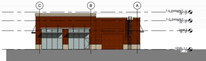
② North1 1" = 20'-0"