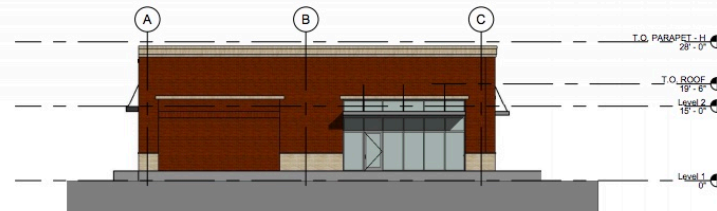
③ South1 1" = 20'-0"