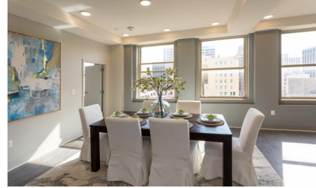
111 Lofts – Residential