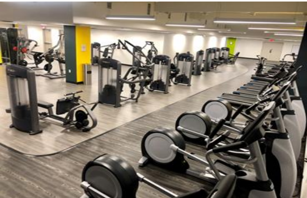
First Place Tower – Fitness Center