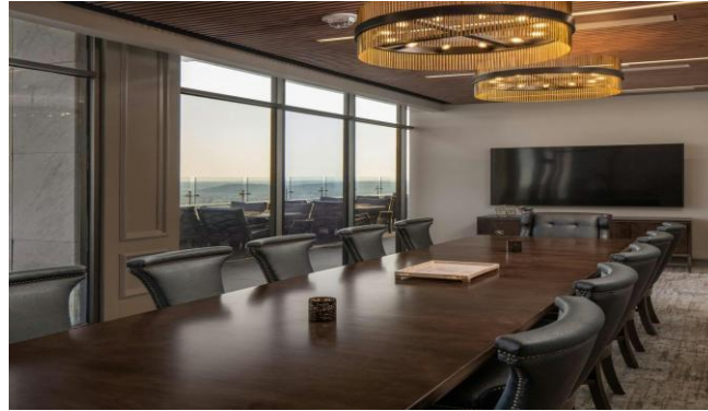
The Summit Club