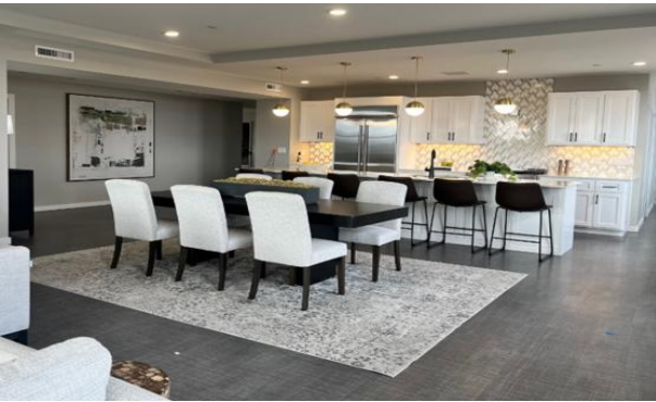
Arco Building - Residential