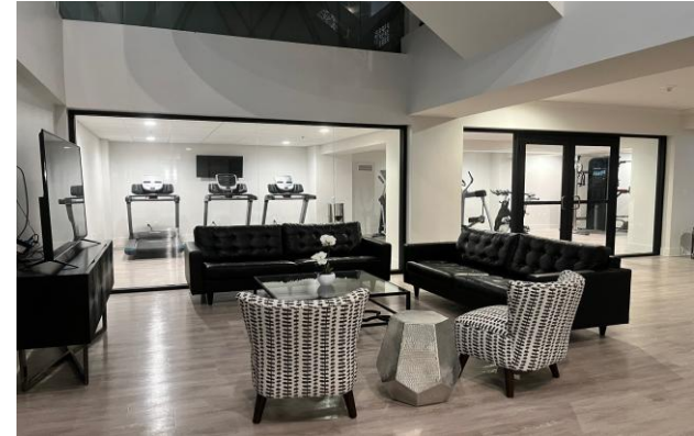
111 Lofts – Community Room / Fitness Center