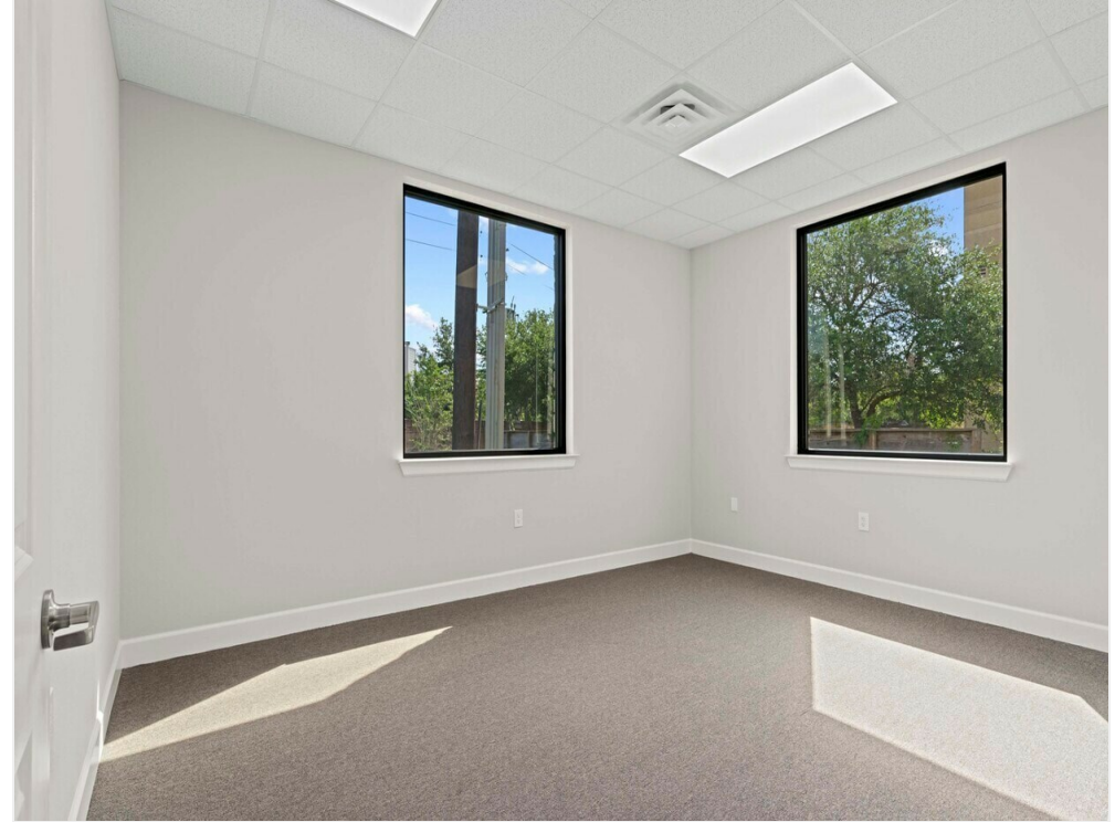
Private Office 2