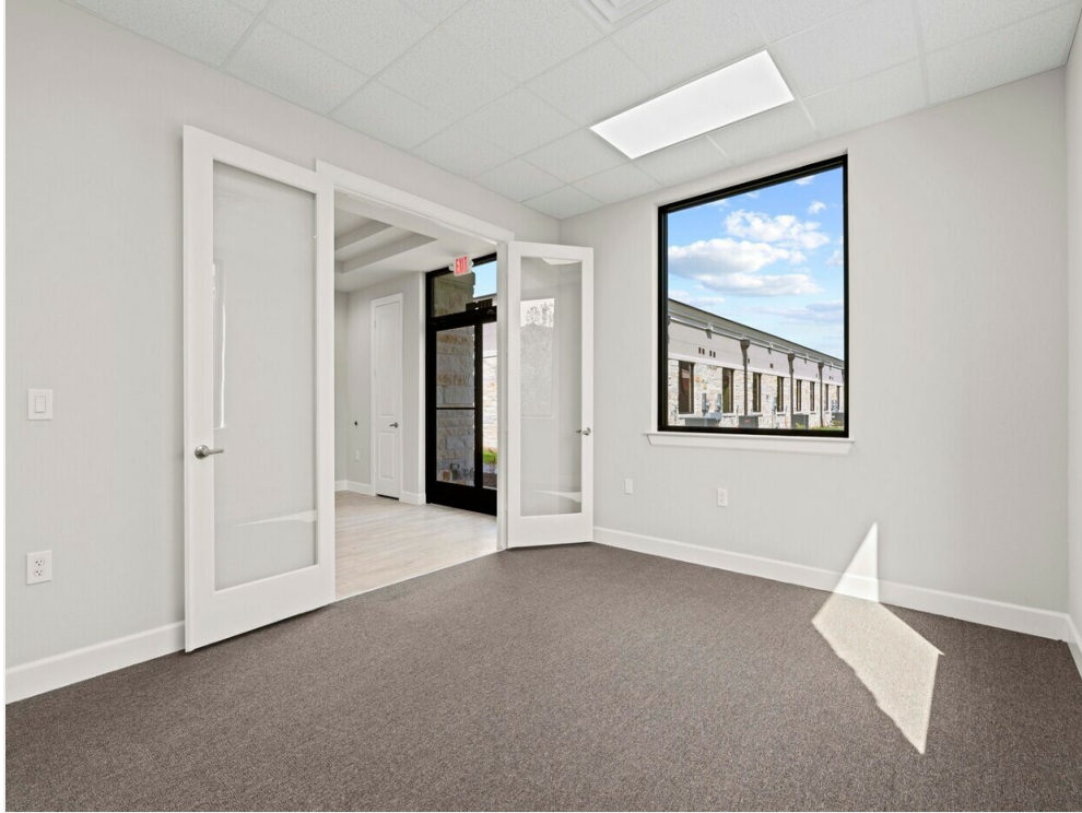
Private Conference Room