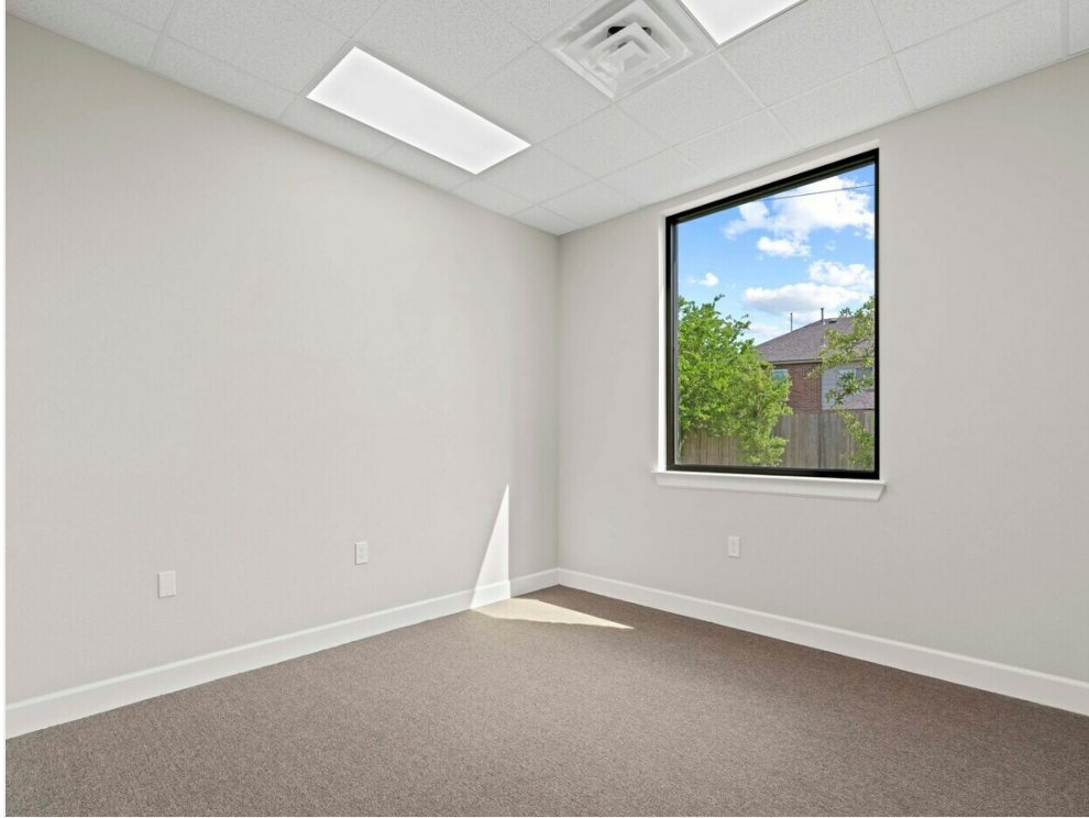
Private Office 3