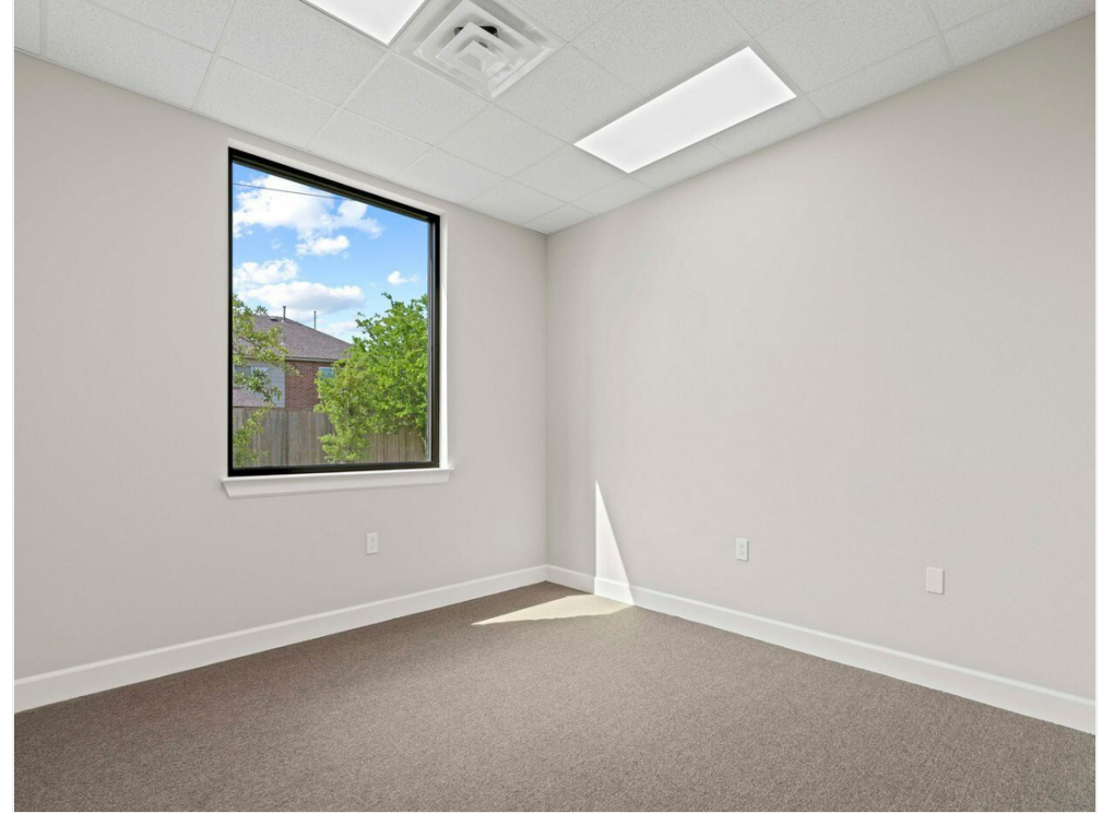
Private Office 3