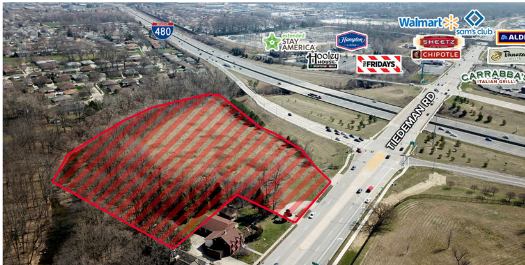
VIEW TO SOUTH