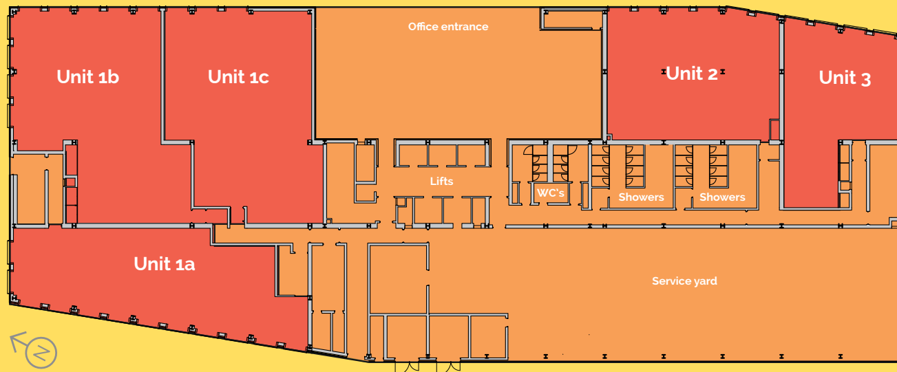
FLOOR AREA (SQ FT)