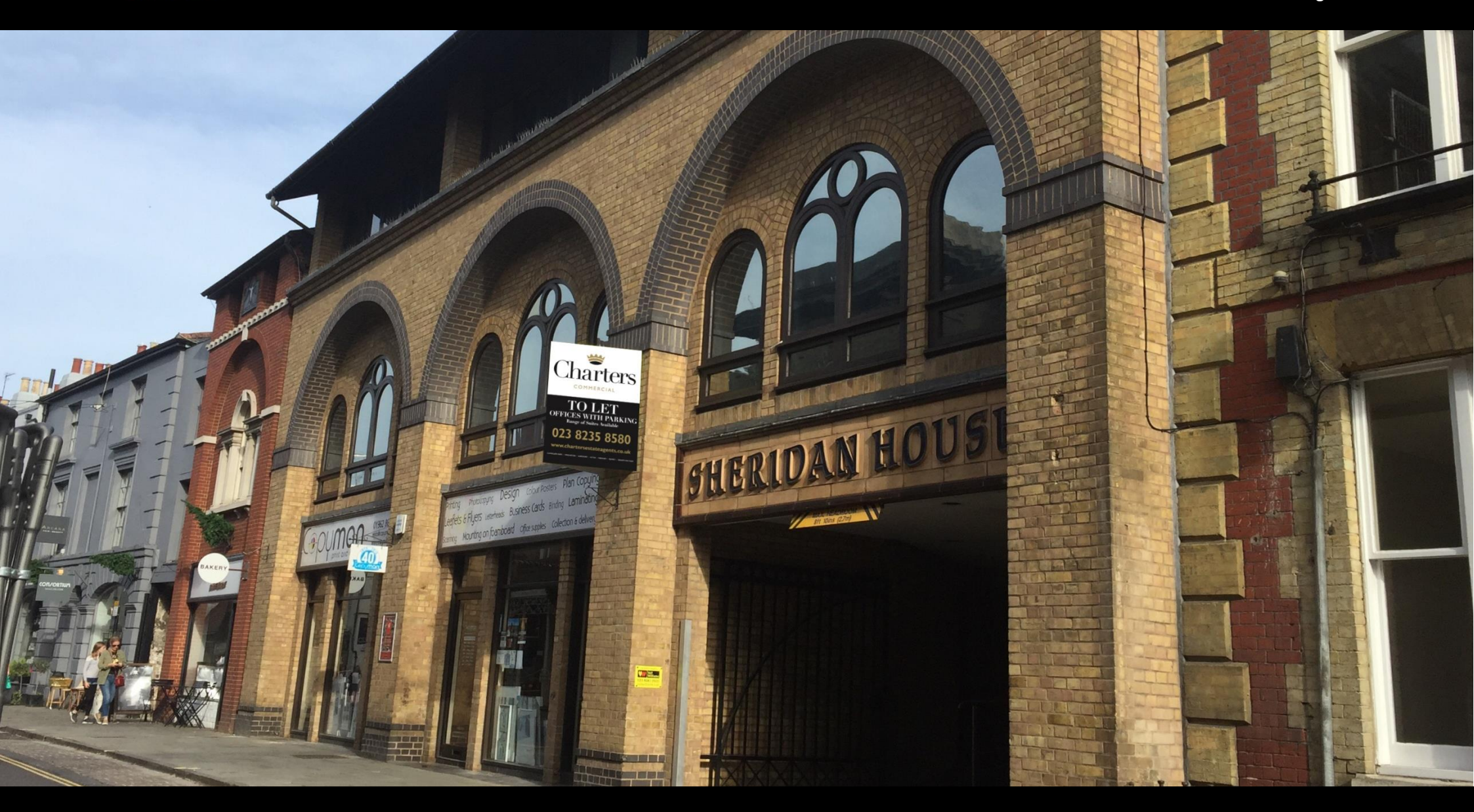
Sheridan House, 40-43 Jewry Street, Winchester, Hampshire, SO23 8RY