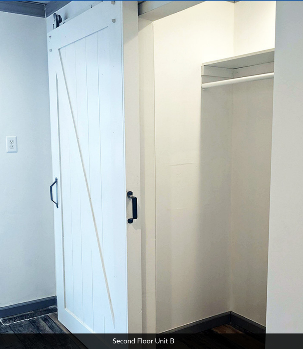
Second Floor Unit B