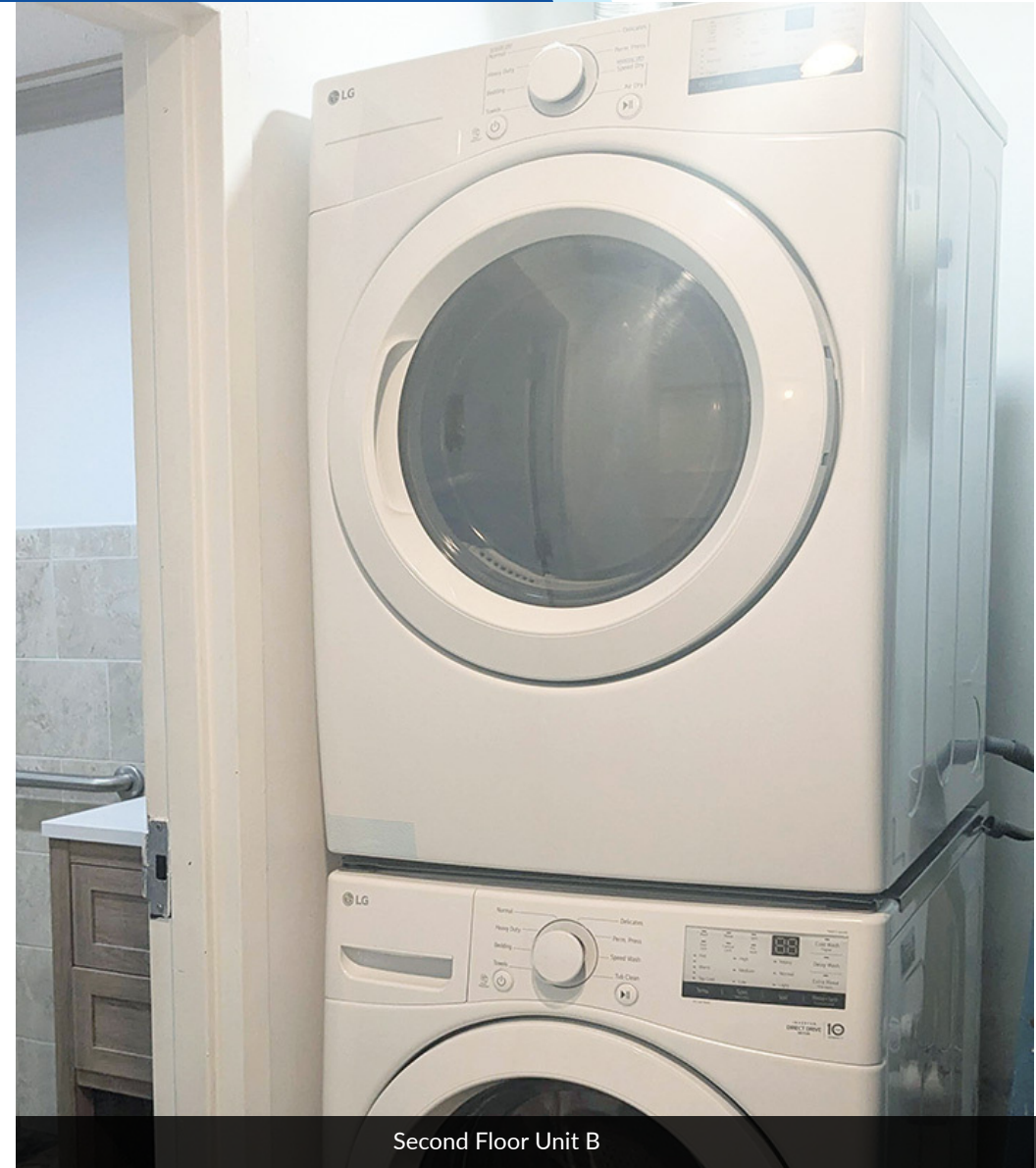
Second Floor Unit B

JOSEPH LATINA, SIOR Managing Principal O: 302.530.1233 | C: 302.414.1000 jlatina@LMTCRE.com