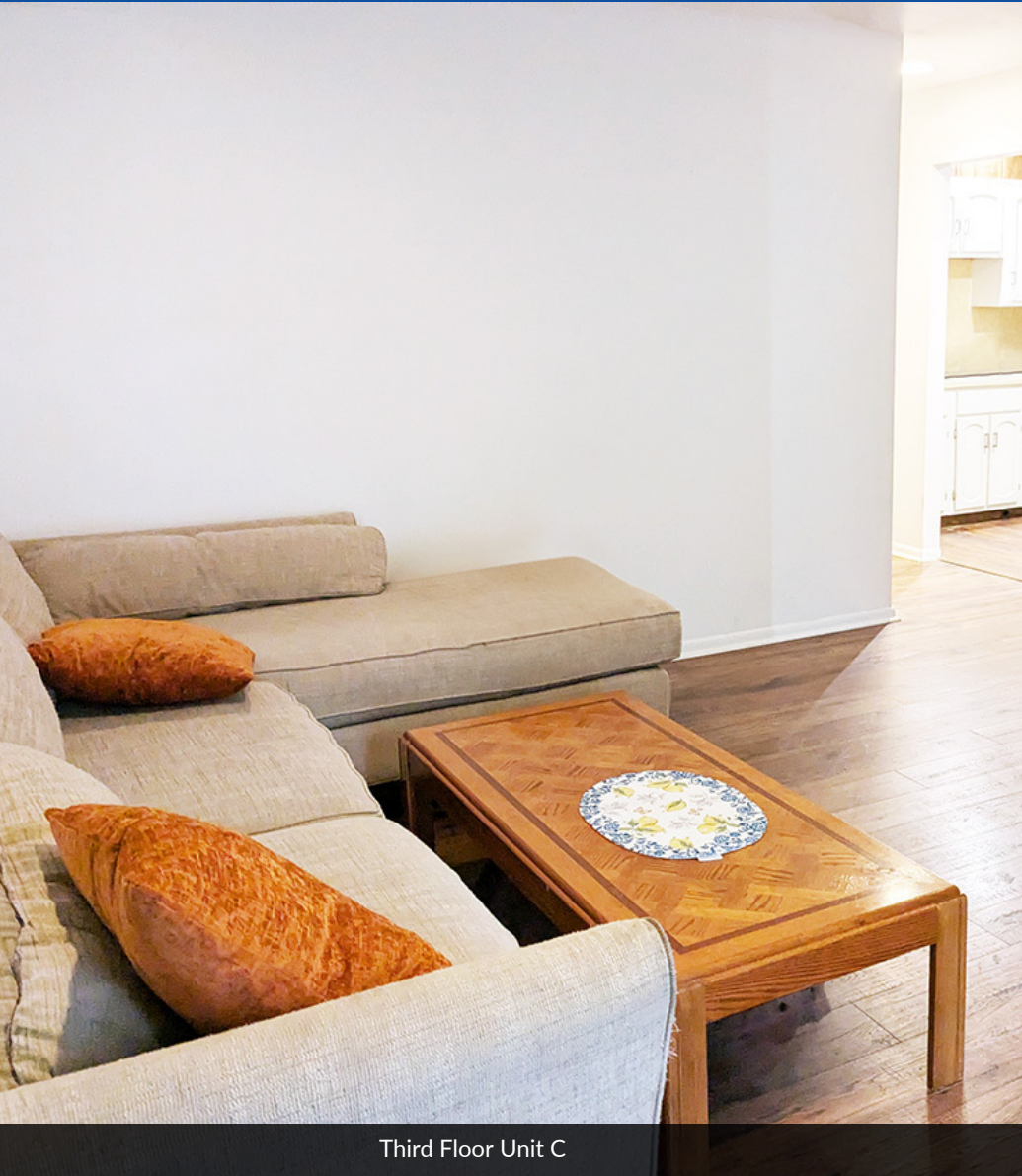
Third Floor Unit C