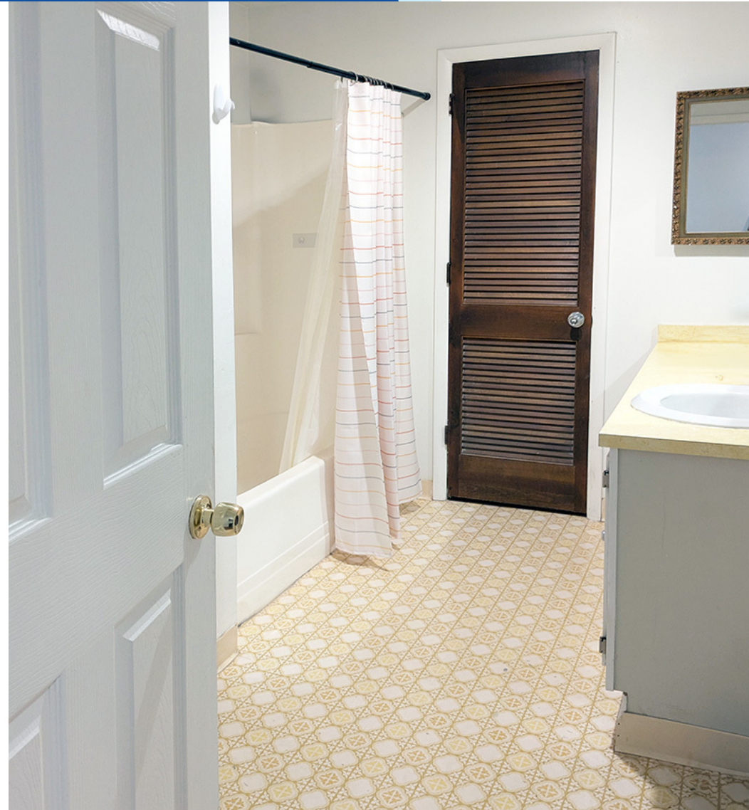
Third Floor Unit C

JOSEPH LATINA, SIOR Managing Principal O: 302.530.1233 | C: 302.414.1000 jlatina@LMTCRE.com