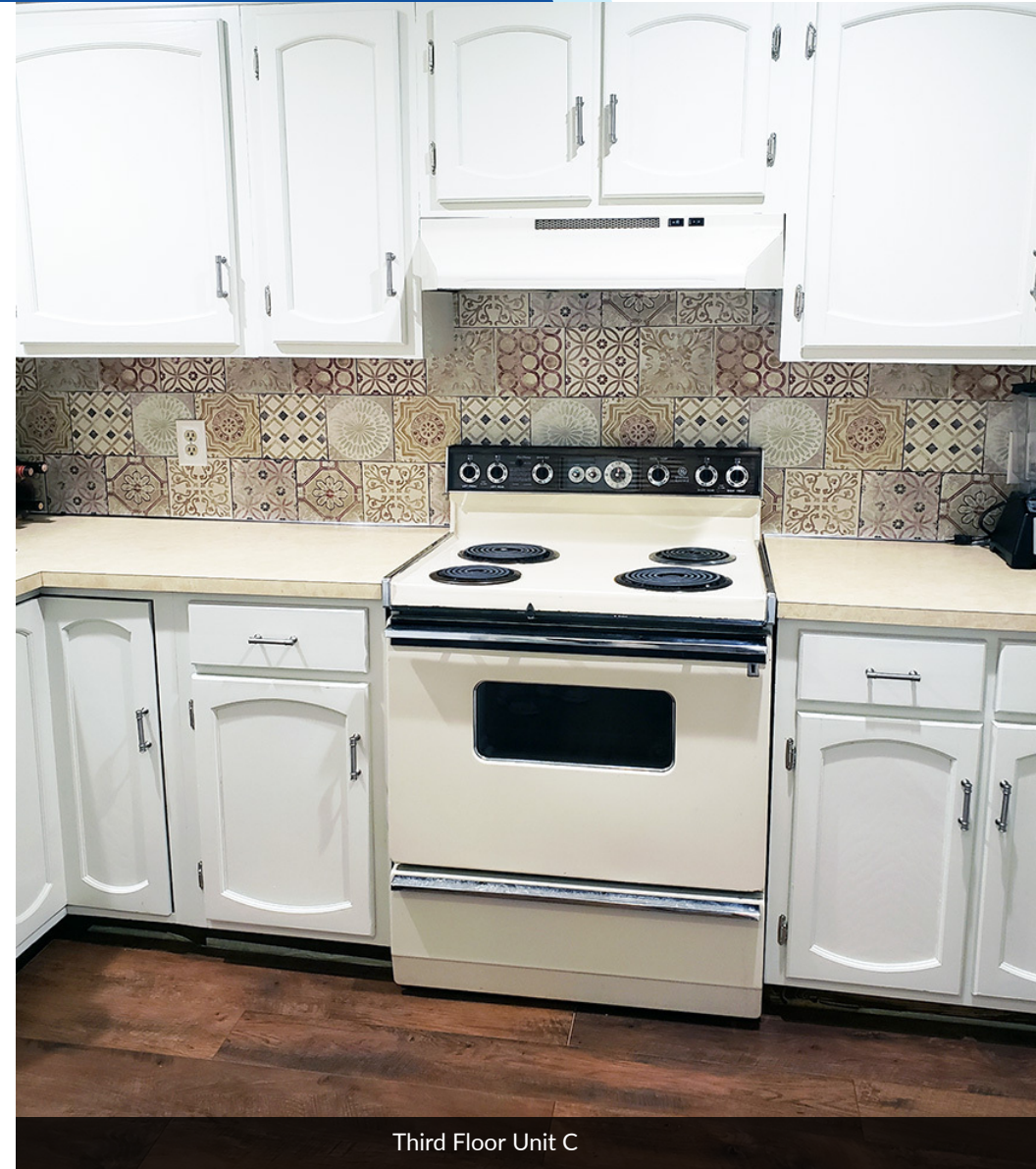
Third Floor Unit C

JOSEPH LATINA, SIOR Managing Principal O: 302.530.1233 | C: 302.414.1000 jlatina@LMTCRE.com