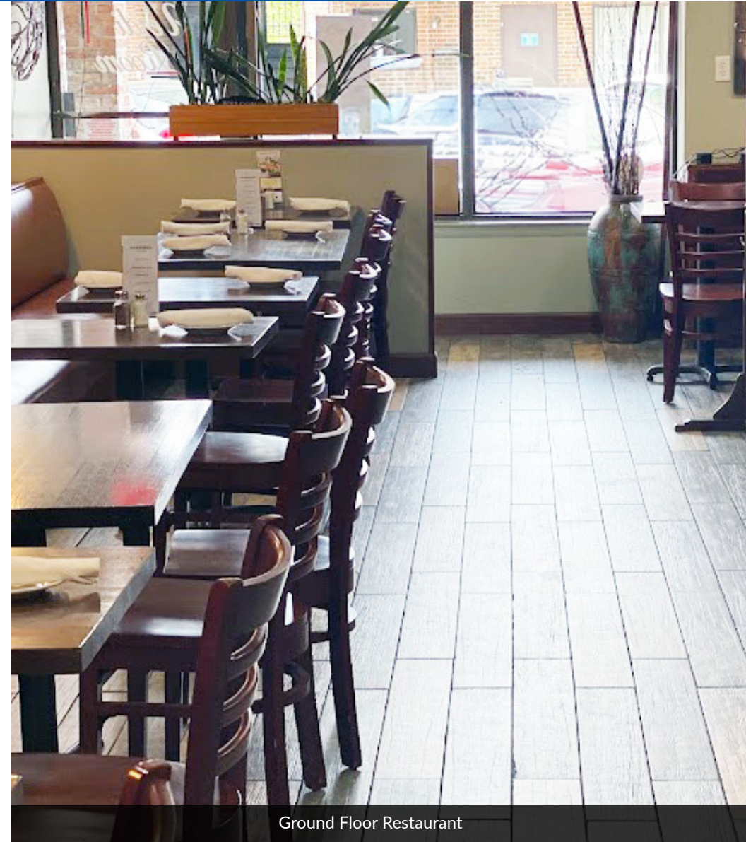
Ground Floor Restaurant