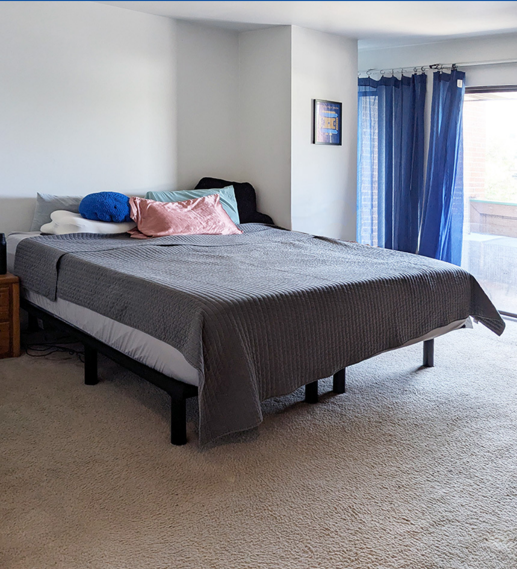
Third Floor Unit C