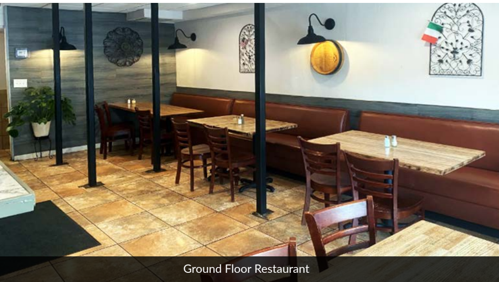
Ground Floor Restaurant

JOSEPH LATINA, SIOR Managing Principal O: 302.530.1233 | C: 302.414.1000 jlatina@LMTCRE.com