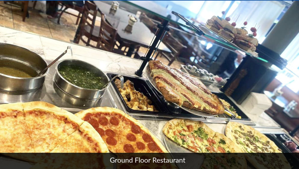
Ground Floor Restaurant