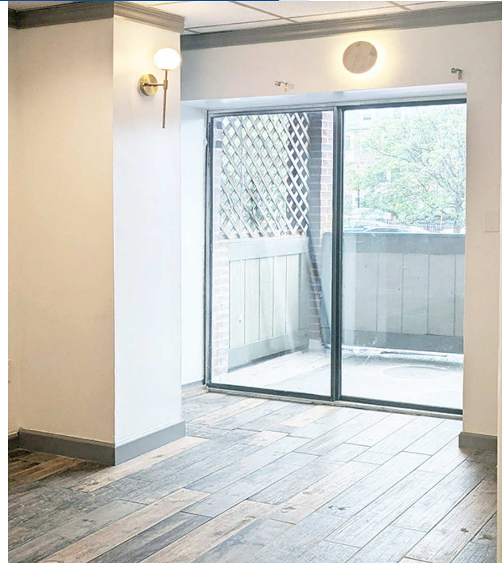
Second Floor Unit B

JOSEPH LATINA, SIOR Managing Principal O: 302.530.1233 | C: 302.414.1000 jlatina@LMTCRE.com