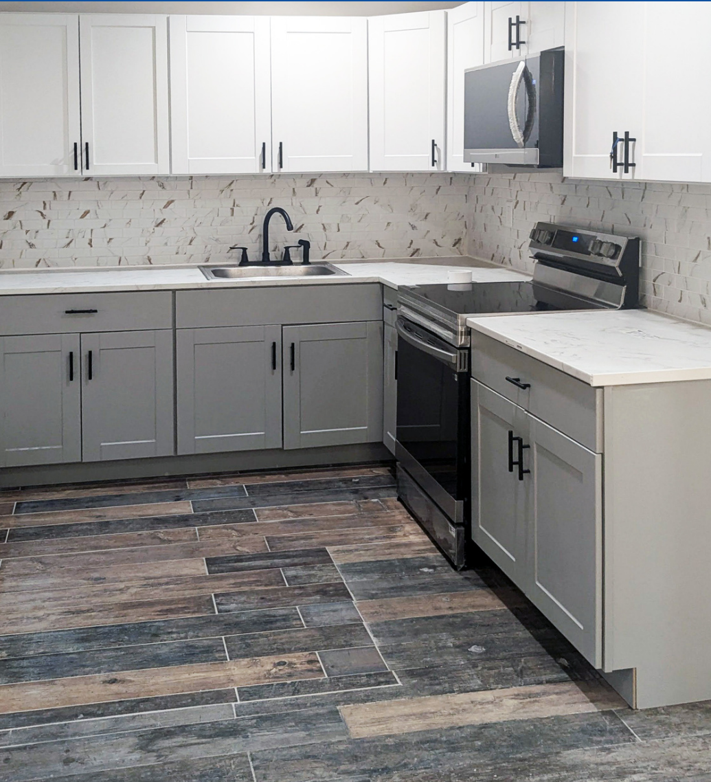
Second Floor Unit B