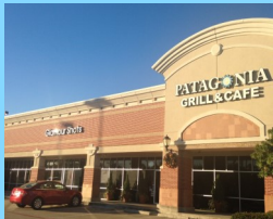
Retail Space Available