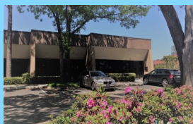
Flex Space Available