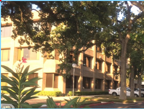
Management: 8554 Suite 301