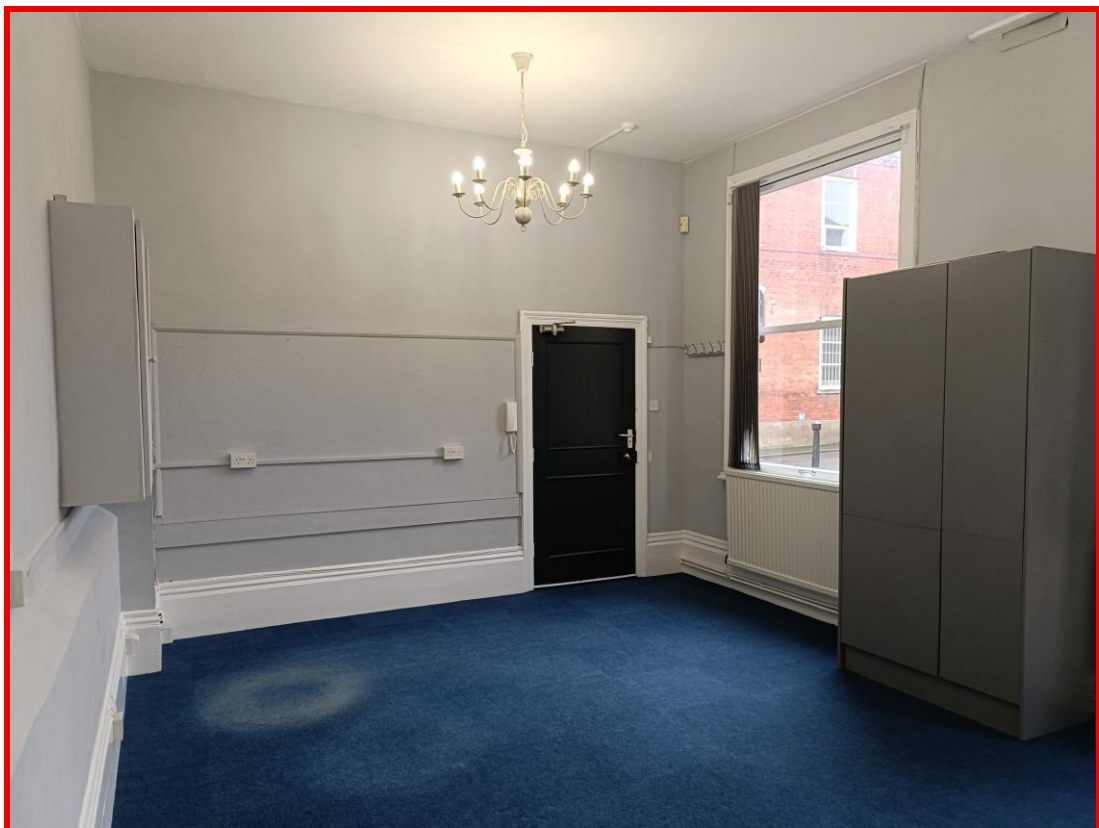
Room 14 Elmer House