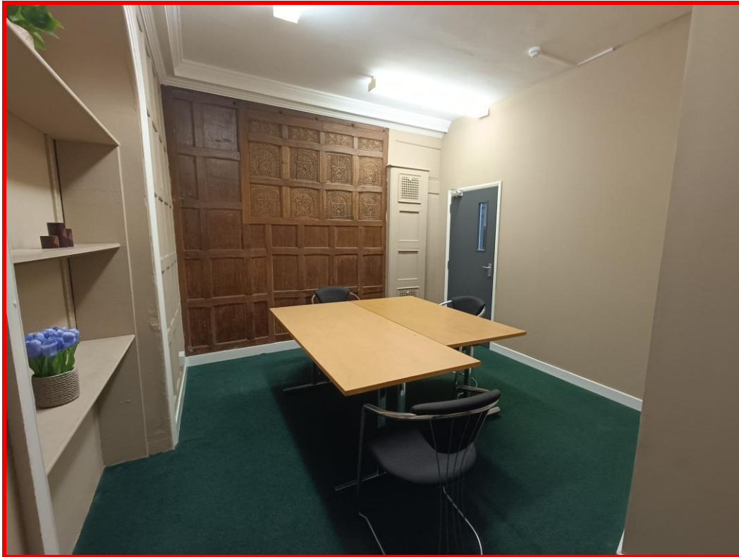
Meeting Room, Elmer House