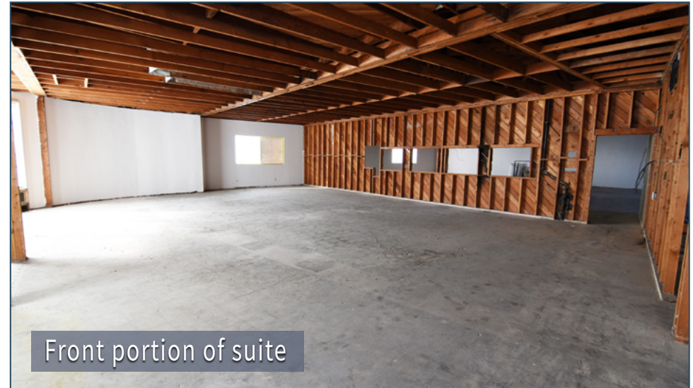
Front portion of suite