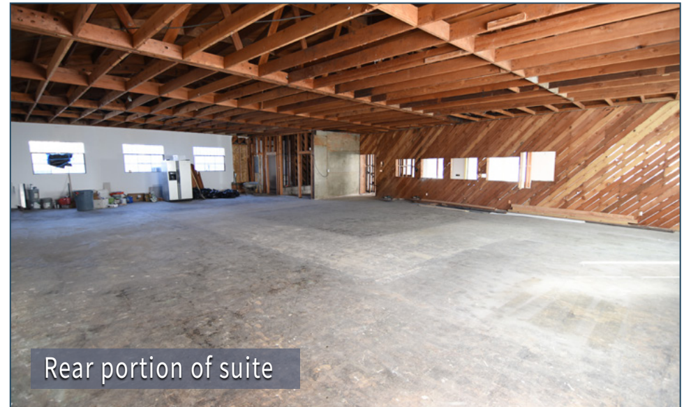
Rear portion of suite