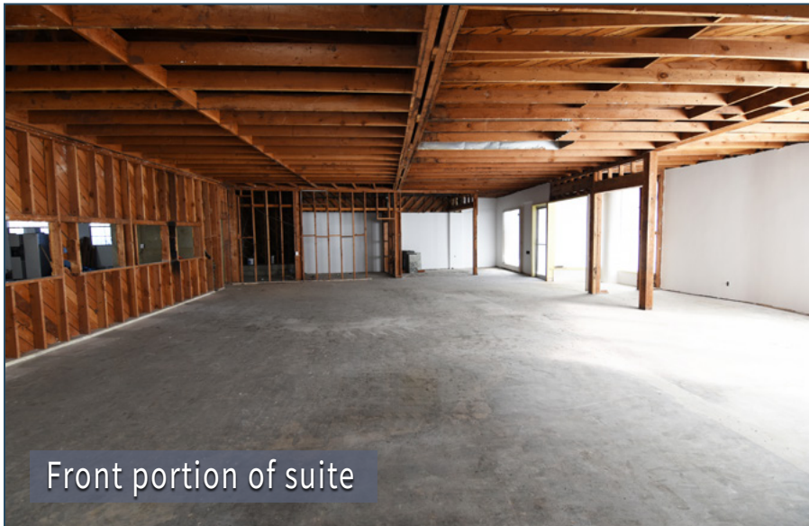
Front portion of suite