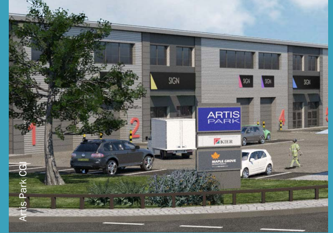
Artis Park CGI