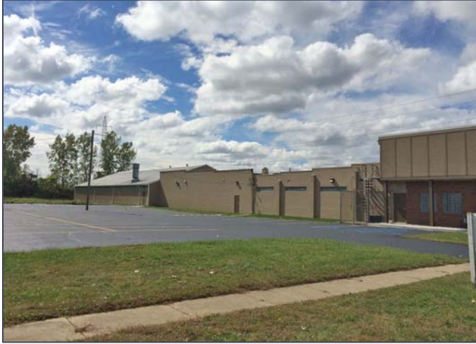
Parking along east elevation