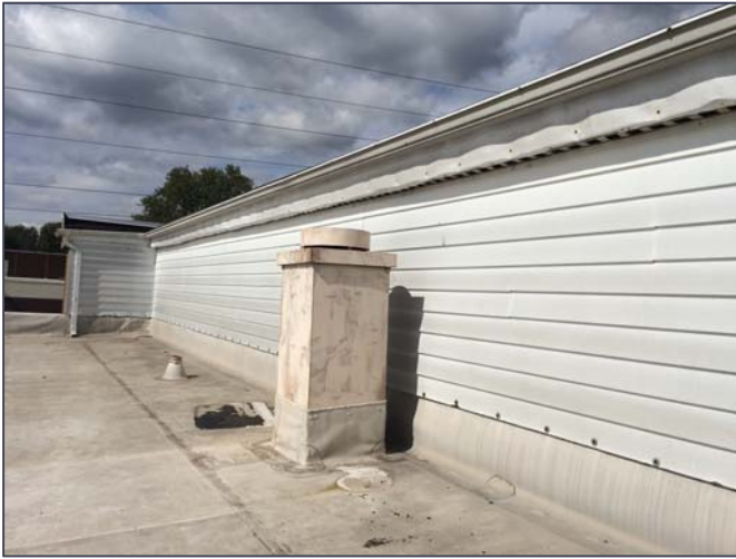
2 nd level flushing