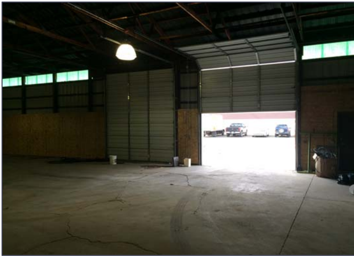
Overhead doors in rear