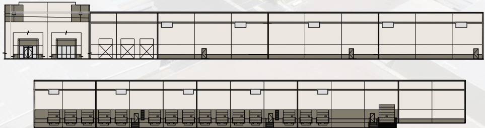
PHASE 1 CONCEPTUAL ELEVATIONS