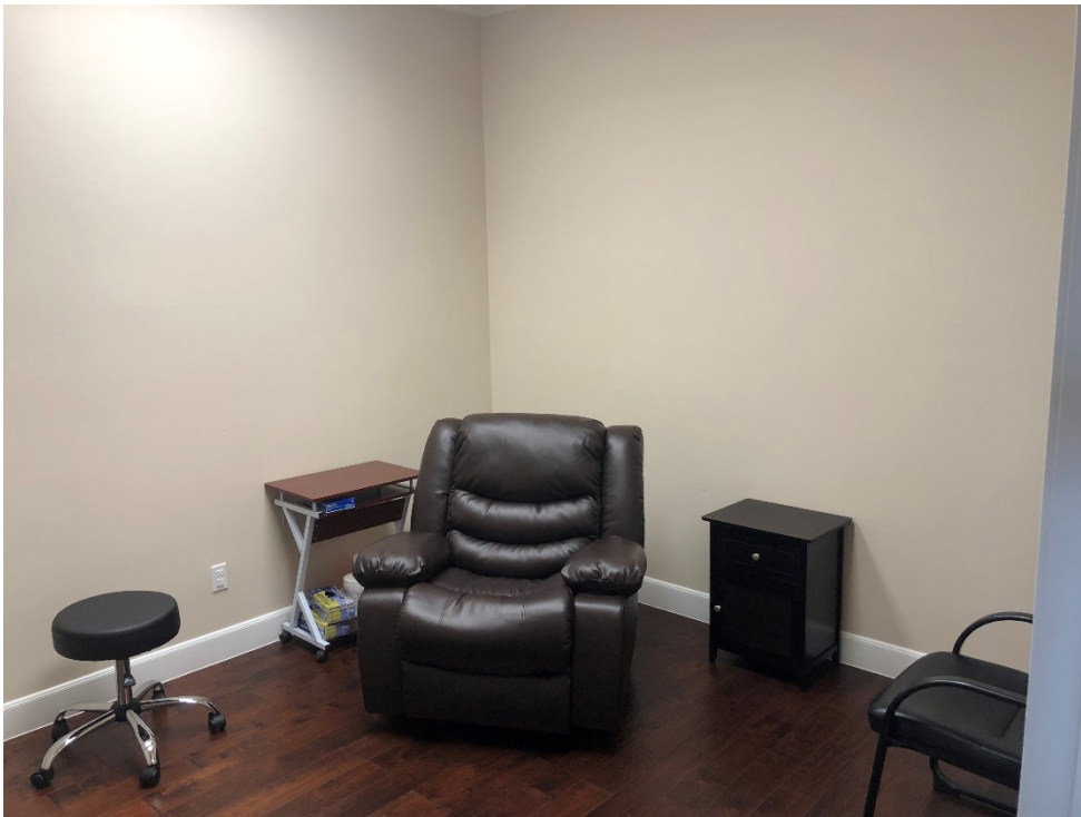
Typical Exam Room