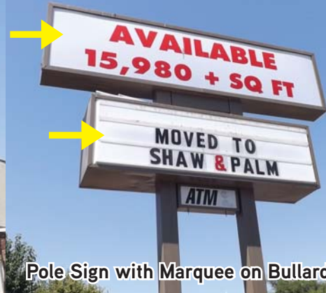
Pole Sign with Marquee on Bullard