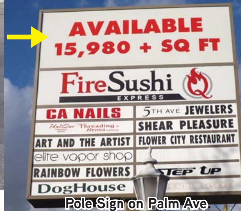
Pole Sign on Palm Ave.