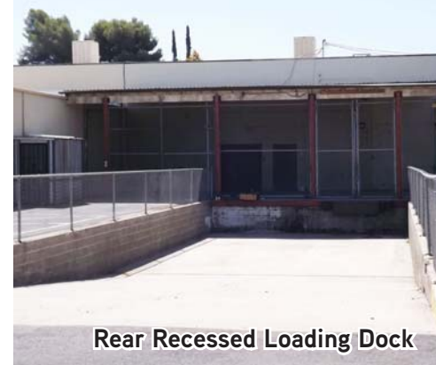
Rear Recessed Loading Dock

AGENT: GERALD CROSS 559 221 1271 | EXT. 103 FRESNO, CA gerald.cross@colliers.com BRE #00992292