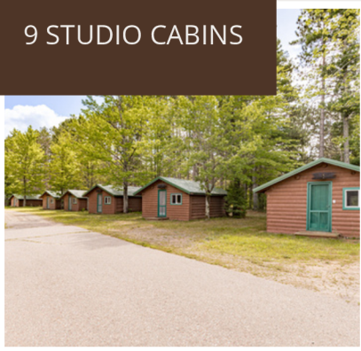
9 STUDIO CABINS