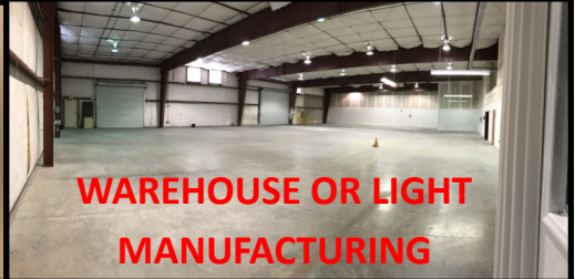
WAREHOUSE OR LIGHT MANUFACTURING