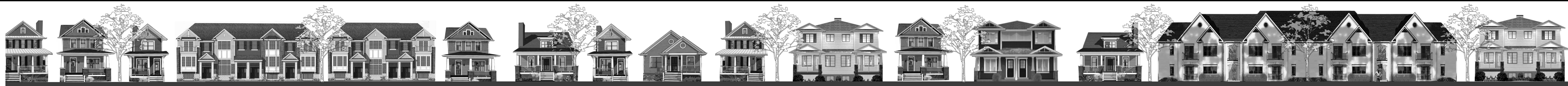
REPRESENTATIVE TYPICAL MIXED-PRODUCT STREETScape