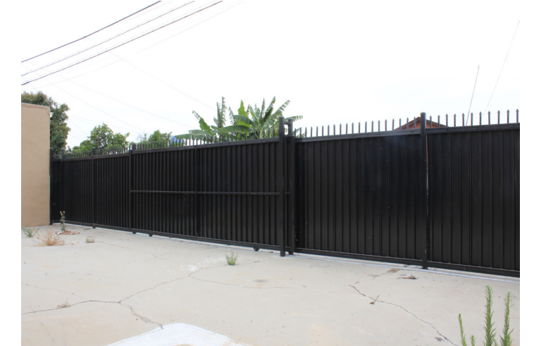
Secured Parking in rear of building