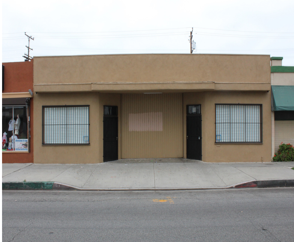
14 x 15 Ground Level Drive in front Door