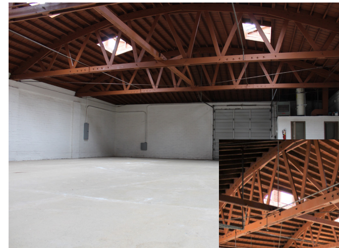
Bow Truss Ceiling