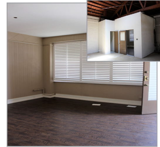
Small Office Space