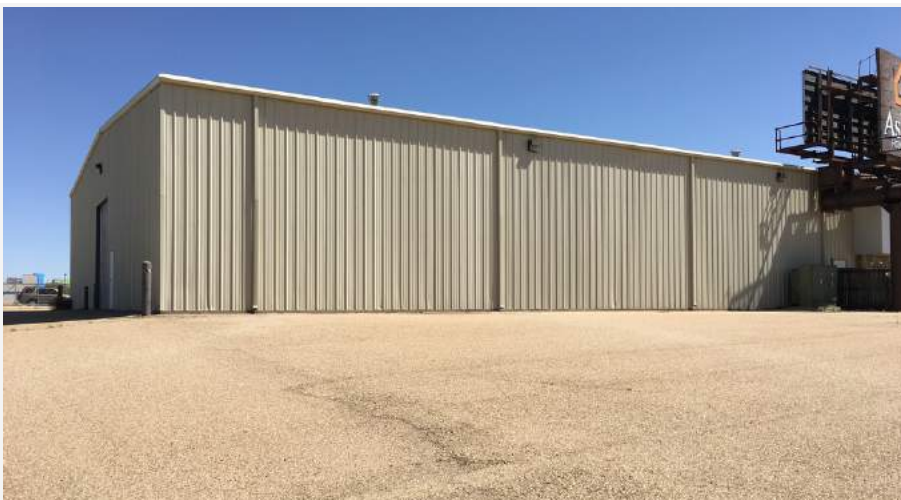
Outdoor, Fenced Stack-lot