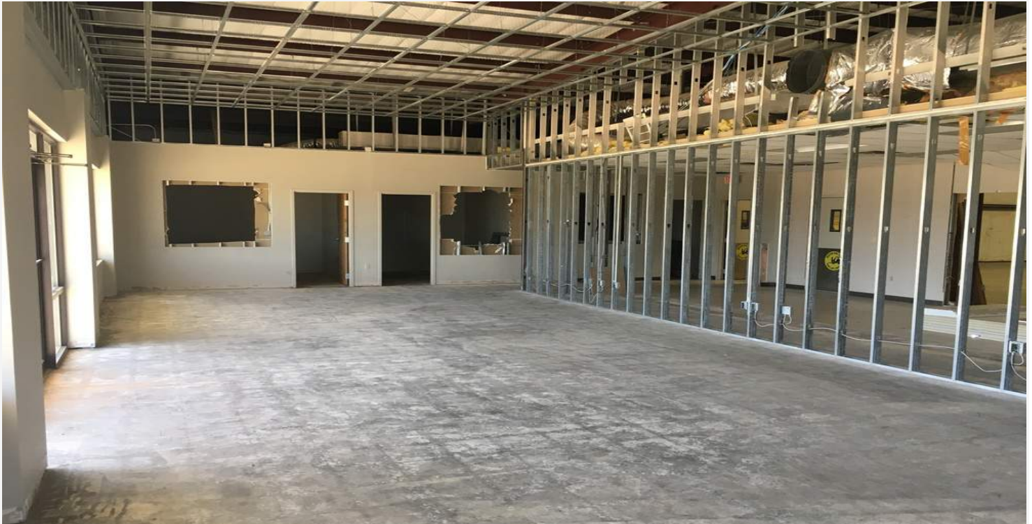
Tenant finish out allowance to complete space - negotiable. Contact broker for details