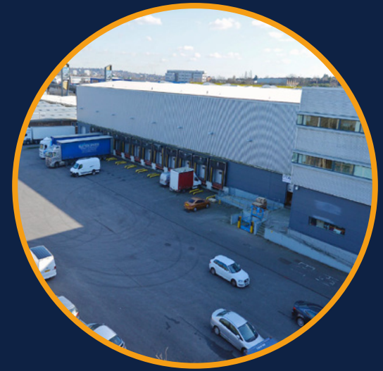
Dock level loading doors