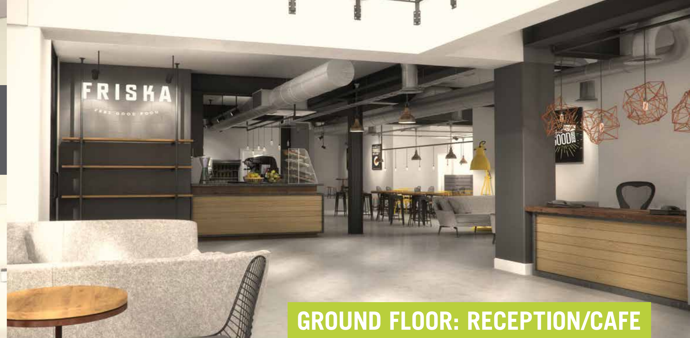
GROUND FLOOR: RECEPTION/CAFE

Whilst the exterior is a great example of forward-thinking 60's architecture, the internal communal spaces feature contemporary urban design. Refashioned in an industrial but relaxed aesthetic, HERE celebrates clean lines and the raw finish of natural materials.