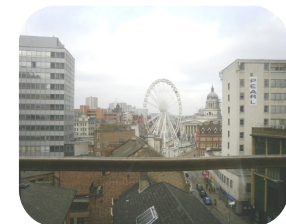
View from 5 th floor balcony