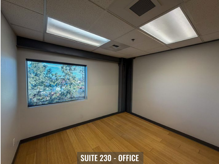
SUITE 230 - OFFICE

20802 & 20806 Sockeye Pl, Bend, OR 97701