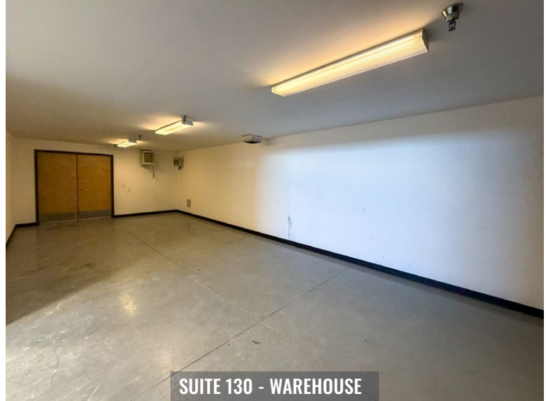
SUITE 130 - WAREHOUSE