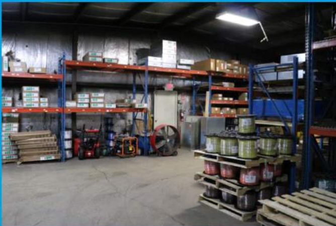
Heated Warehouse Area