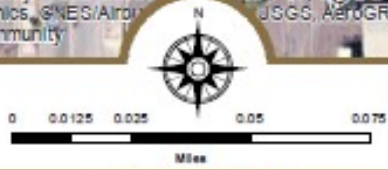
County Land Explorer Map - St. Louis County MN

St. Louis County, MN - Enterprise GIS, St. Louis County - Enterprise GIS, St. Louis County - Land & Mineral Services, Esri, DigitalGlobe, GeoEye, Earthstar Geographics, CNES/Airbus, DigitalGlobe, GeoEye, IGN, AerGRID, IGN, and the GIS User Community