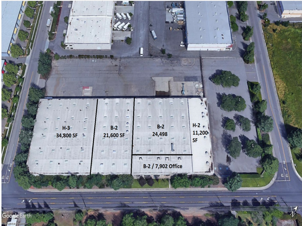
2644 Hegan Ln Building SF