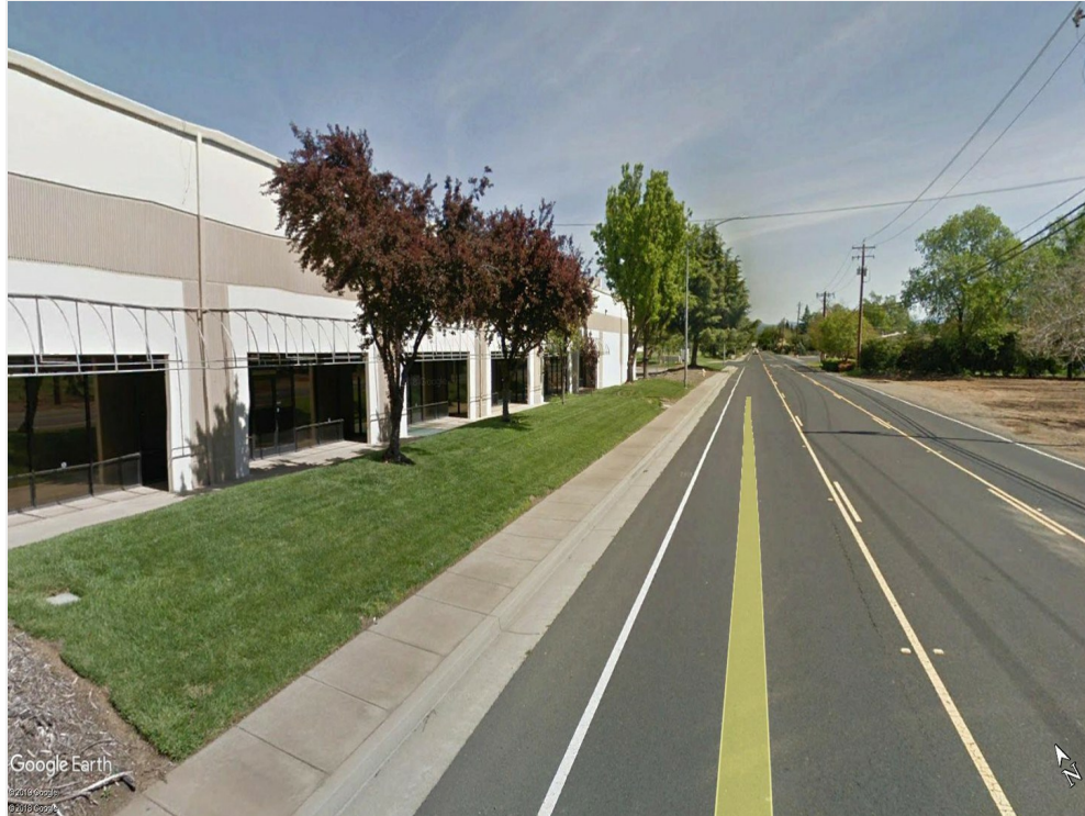
Hegan Lane Frontage