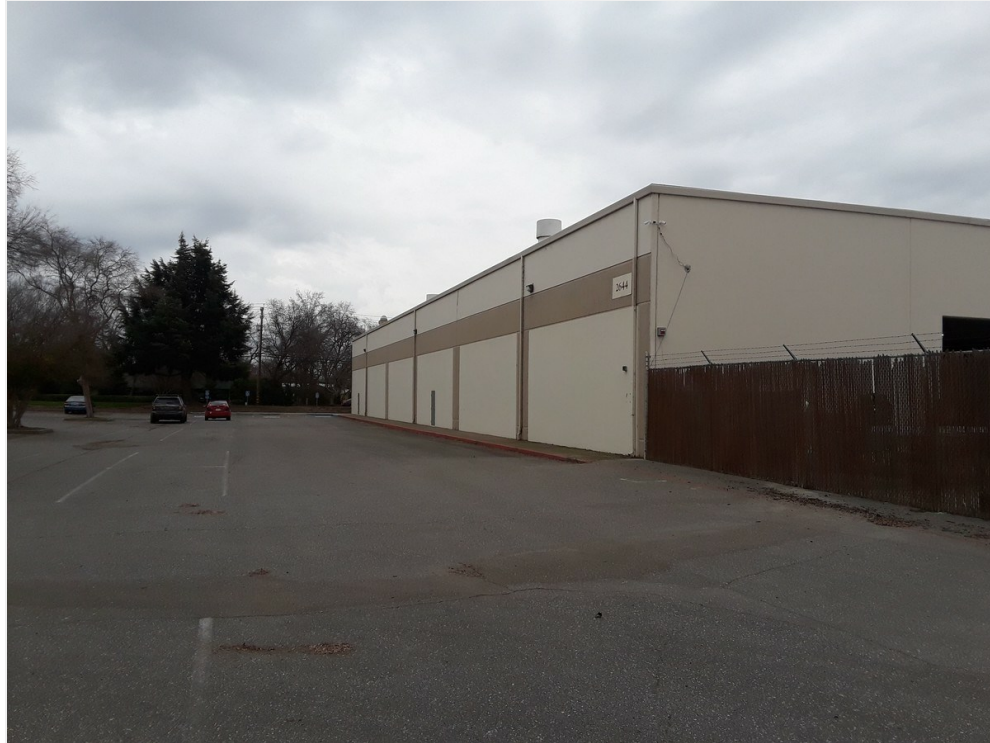
Otterson Drive / East Side