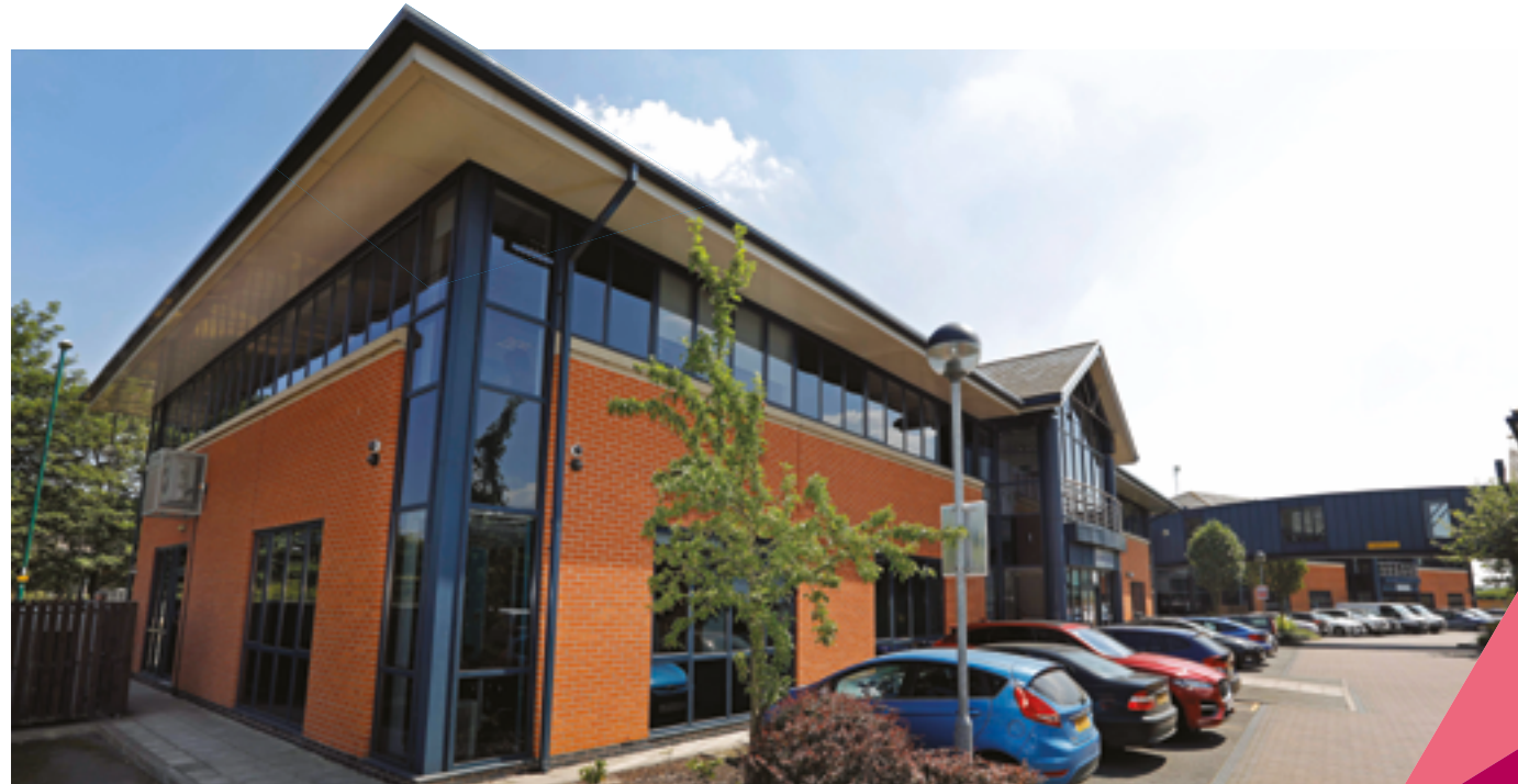
1. CARDINAL HOUSE - 10,000 sq ft