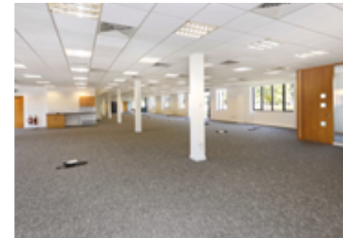
OPEN PLAN FLOOR PLATES