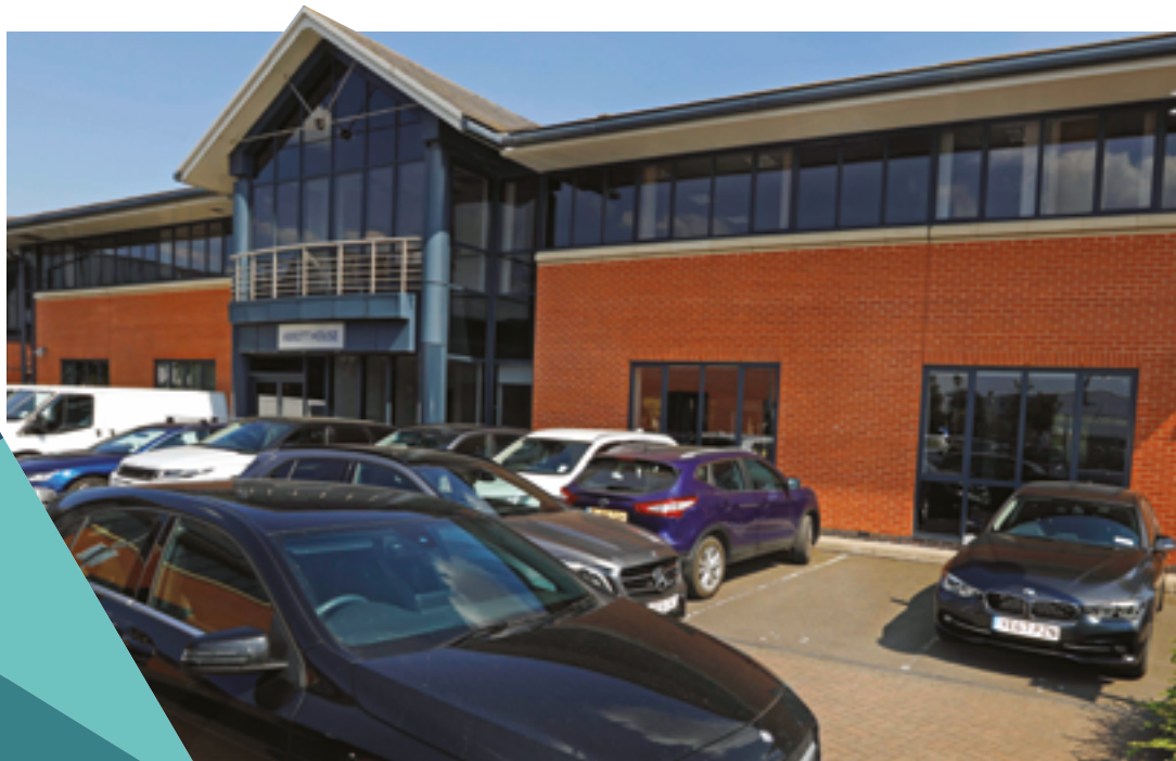
2. ABBOTT HOUSE – 5,000 sq ft

The current service charge level is approximately based upon £1.20 per sq ft.