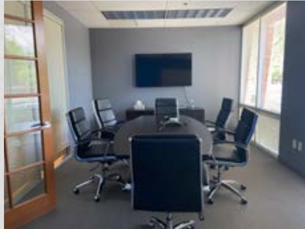
Private conference rooms