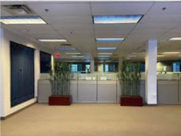
Clean, plug and play office space