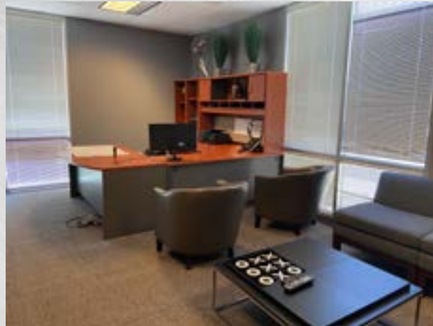
Executive offices and private restrooms