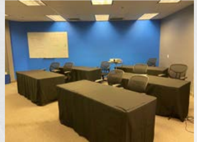
Large training room