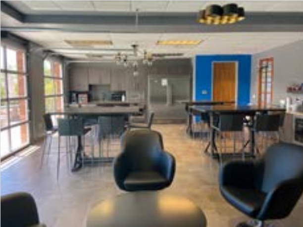
Bright, modern kitchen