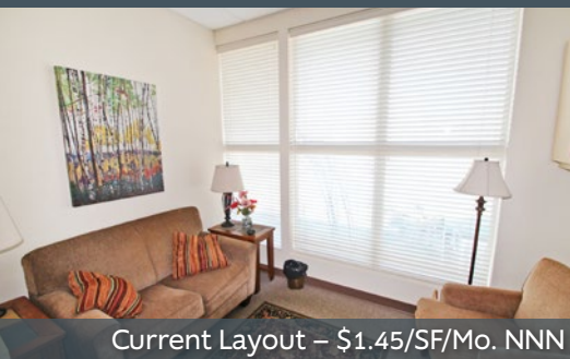
Current Layout – $1.45/SF/Mo. NNN