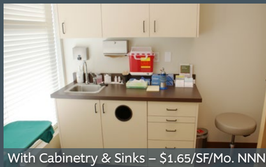
With Cabinetry & Sinks – $1.65/SF/Mo. NNN