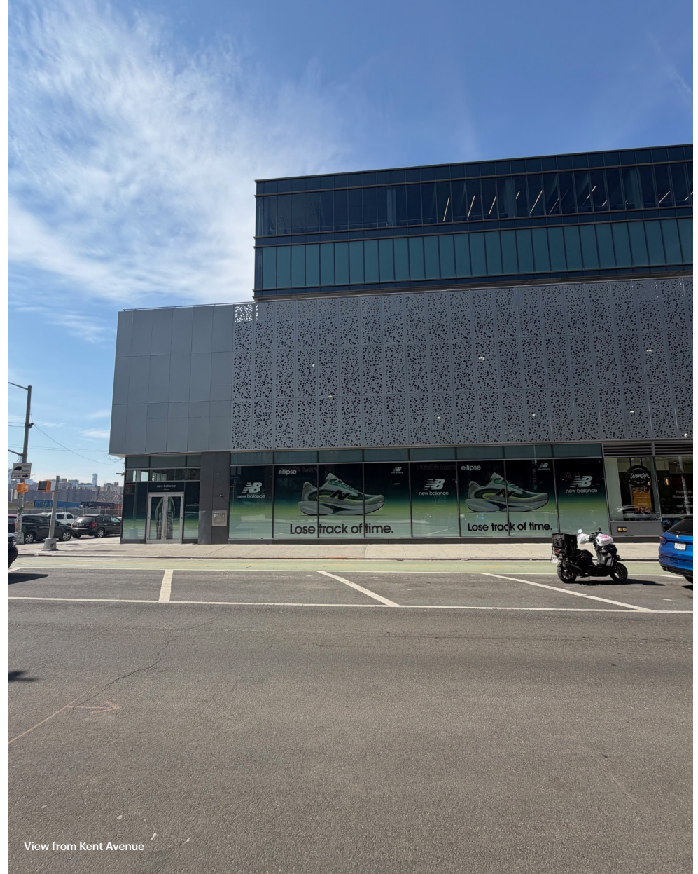
View from Kent Avenue