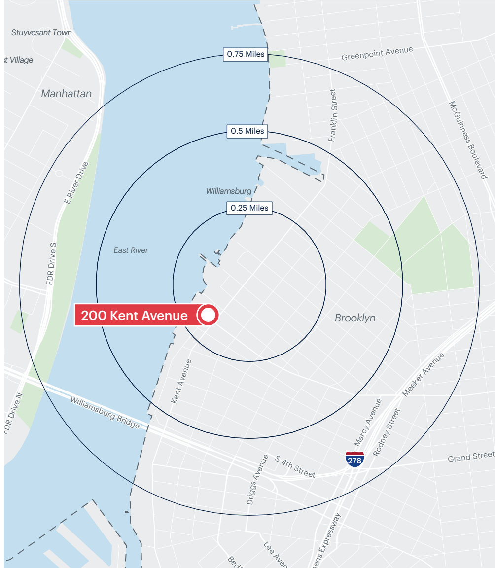
200 Kent Avenue, Williamsburg, Brooklyn