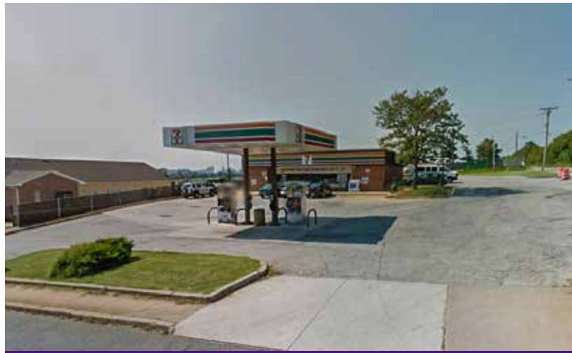
TANKS AND CANOPY REMOVED