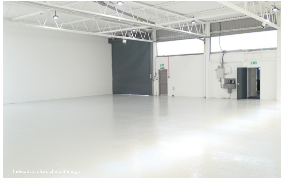
Indicative refurbishment image