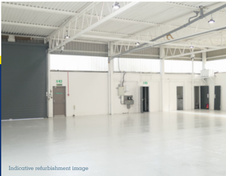
Indicative refurbishment image