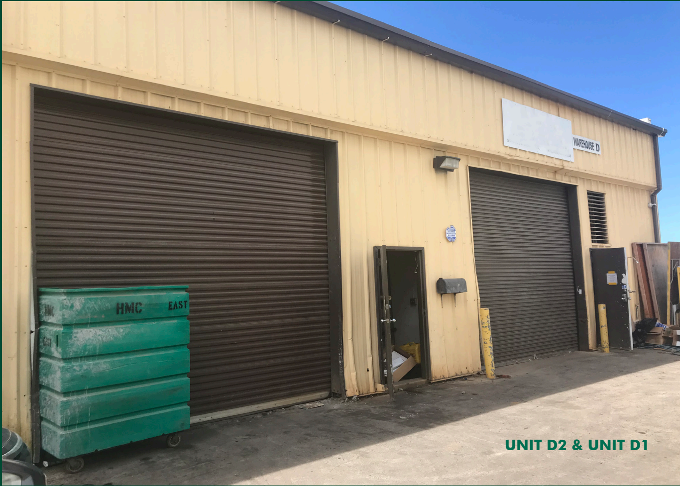
UNIT D2 & UNIT D1