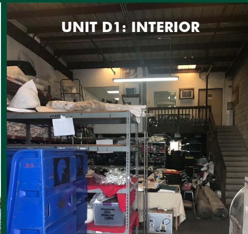
UNIT D1: INTERIOR