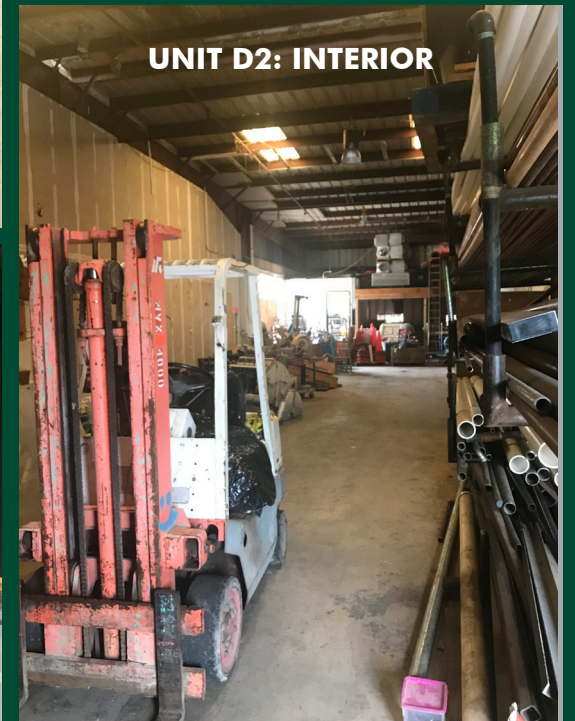
UNIT D2: INTERIOR