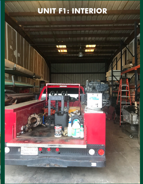
UNIT F1: INTERIOR