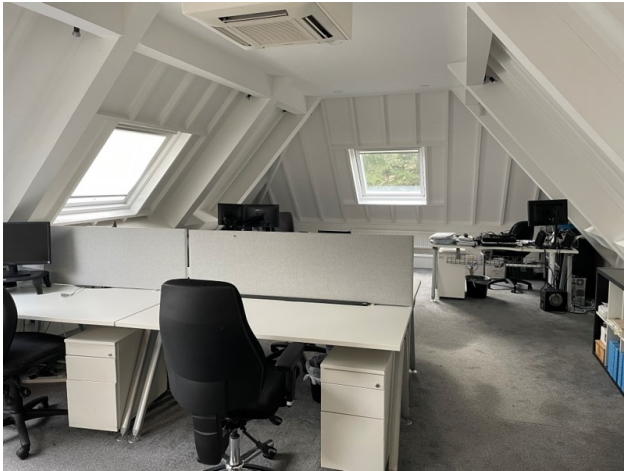
First Floor - Room 3