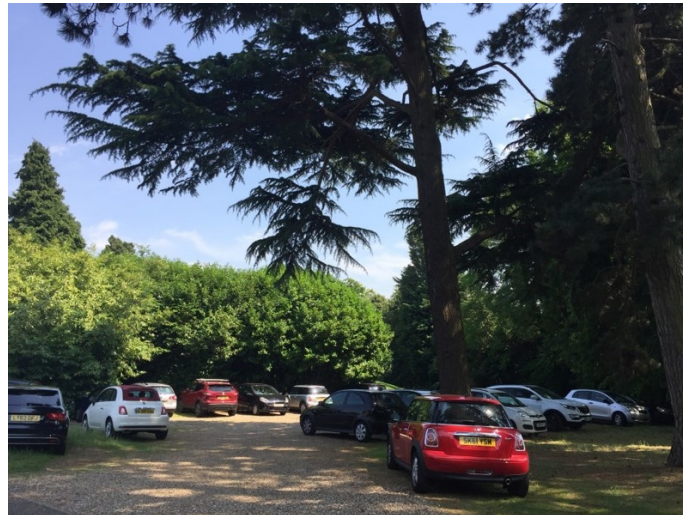
Shared Visitor Parking