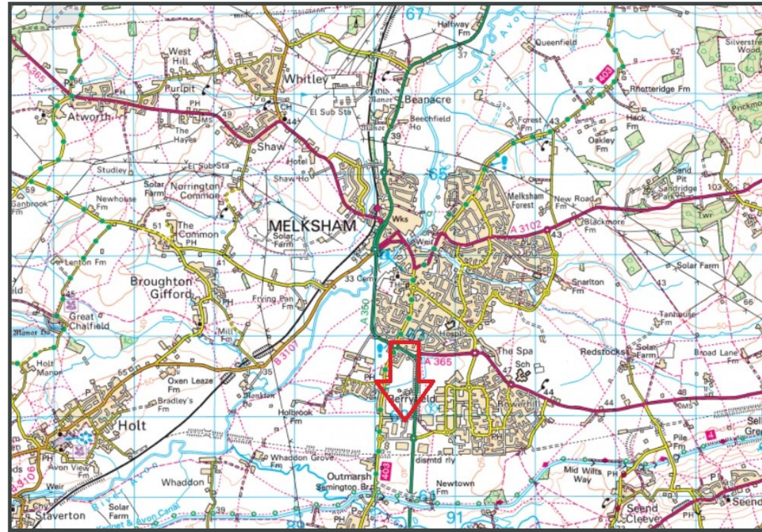
For identification purposes only