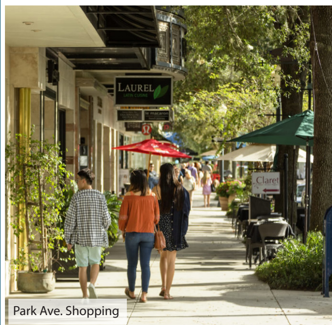
Park Ave. Shopping